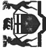
Charles Sousa, Finance Minister Province of Ontario

“I am supportive of requesting the federal government to refrain from withdrawing Canada’s membership in the Bureau International des Expositions while the City of Toronto conducts its due diligence. The Province would, of course, be a partner where and when appropriate throughout this information gathering and fact finding process.”