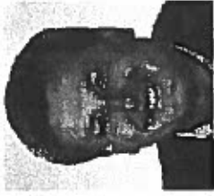
CivicAction Greater Toronto CivicAction Alliance John Tory, Chair Greater Toronto CivicAction

“Events of a global scale, like the Expos overseen by the BIE, help accelerate economic development and engage the more than 6 million Canadians living in the Greater Toronto Area in a unique, world-class experience”