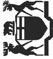
Michael Chan, Minister Ontario Ministry of Tourism, Culture & Sport

“The benefits for all Canadians with Toronto as host of Expo 2025 would include significant job creation, new value-added GDP growth, increases in tourism and a global marketing effort showcasing Canada”