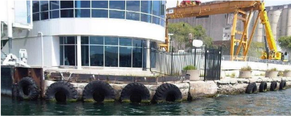
Area 3 (Billy Bishop Toronto City Airport Ferry Slip Corners)