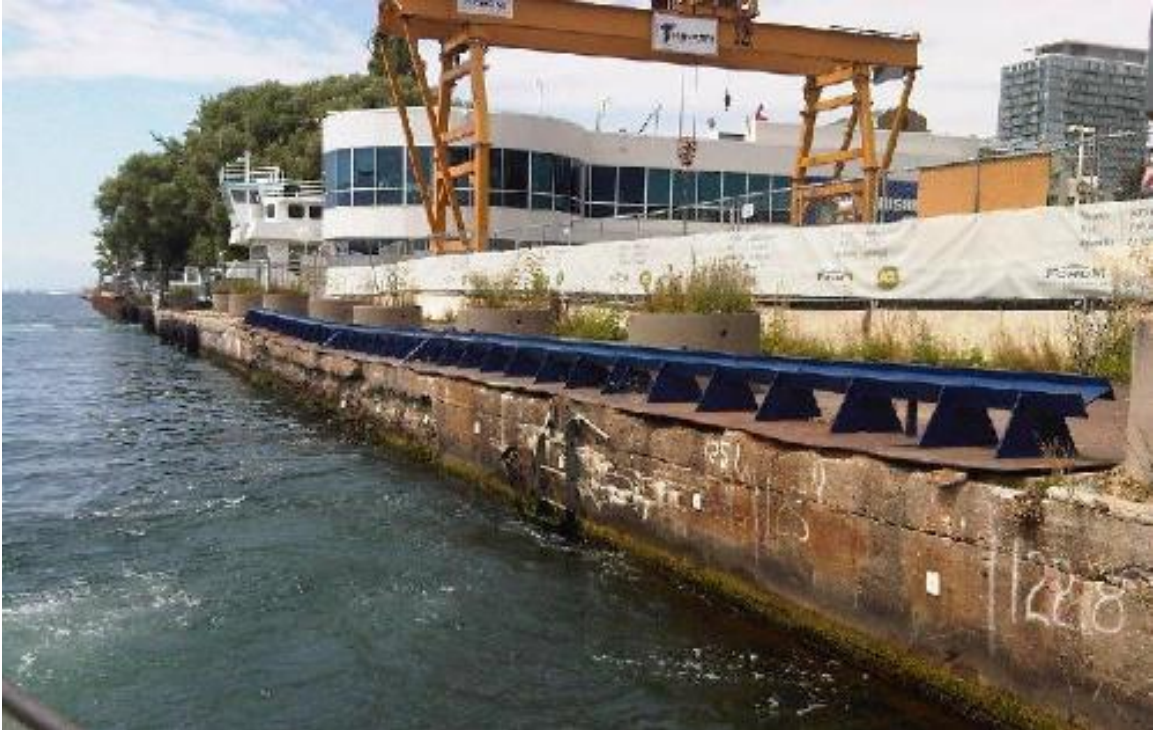
Area 1 and 2 (Looking west towards BBTCA Ferry Terminal to Airport)