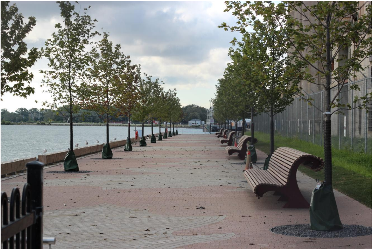
Portland Slip Promenade looking south towards Ireland Park and Western Channel Completed by Waterfront Toronto in 2013