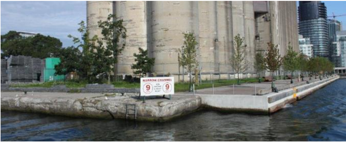
South-east Corner of Canada Malting Site/Ireland Park (Area 1) (Ireland Park on left, Completed Portland Slip Promenade on right)