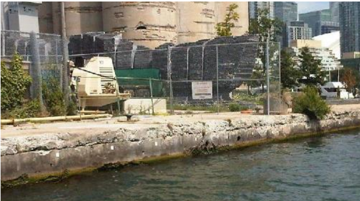
Area 1 (Looking towards Ireland Park)