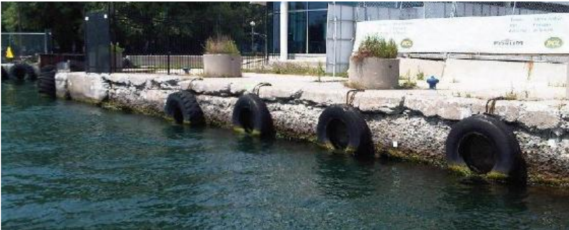
Area 2 (South of BBTCA Ferry Terminal)