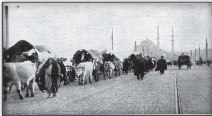
Ottoman refugees from the Balkans entering to Istanbul (1913)

Even before the War the Ottoman Empire had begun to decline continuously as a result of the penetration of European colonialism, nationalism and corresponding warfare. The Russian expansionism and the winds of nationalism that blew from the West resulted in the disintegration of the Western provinces of the Empire and led to the inevitable weakening of the ailing Ottoman State structure. Nearly 4.5 million Ottoman Muslims perished from 1864 to 1922 and many more dead were never counted. Moreover, around 5 million Ottoman citizens were driven away from their ancestral homes in the Balkans and the Caucasus during the period of the Empire's disintegration and found shelter in Anatolia and Istanbul. Armenians, as all the other people that made up the Empire, also suffered immensely. The loss of so many innocent lives and departure from ancestral lands was a common fate.