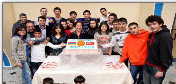
Investing for future: Armenian-Turkish Youth Joint-Basketball Program