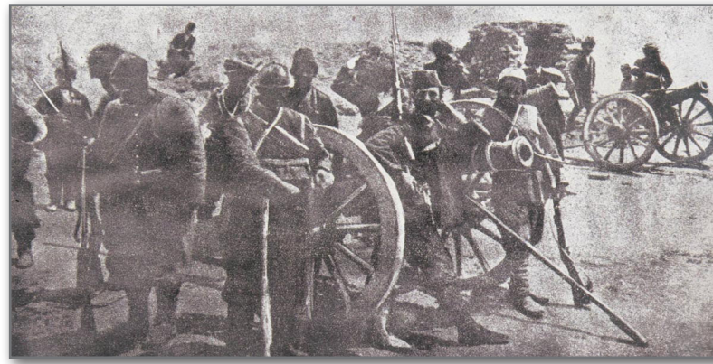
Armenian units fighting along with Russian army to capture the Turkish city of Van (1915)

army to create an ethnically homogenous Armenian homeland.