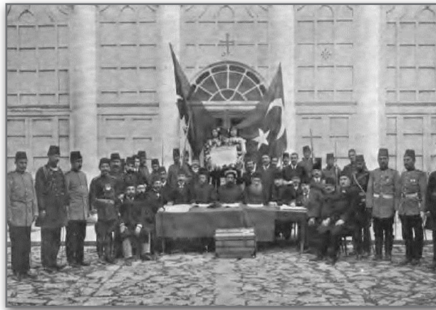
Picture showing Muslim, Armenian and Greek representatives at the 1908 Constitution Declaration

But in the endeavor to overcome historical and political bitterness, all sides must be honest and open-minded. A process of true dialogue, learning to respect the other side's truths, gradually building up respect through familiarity and empathy may well be possible. Could that not help Turkish and Armenian narratives to come closer together around a "just memory"? Believing that this is possible, Turkey proposed the establishment of a joint commission composed of Turkish and Armenian historians, and other international experts, to study the events of 1915 in the archives of Turkey, Armenia and third countries. The findings of the commission might bring about a fuller and fairer understanding of this tragic period on both sides and hopefully contribute to normalization between Turks and Armenians.