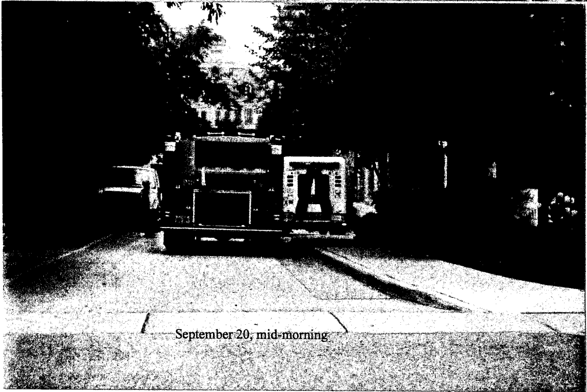
September 20, mid-morning