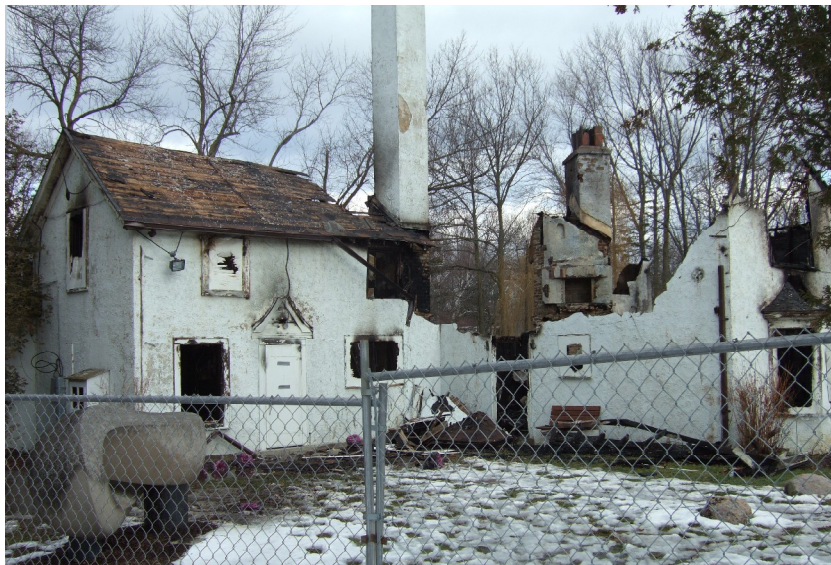
Studio Building following the catastrophic fire on December 25, 2008 that resulted in its demolition