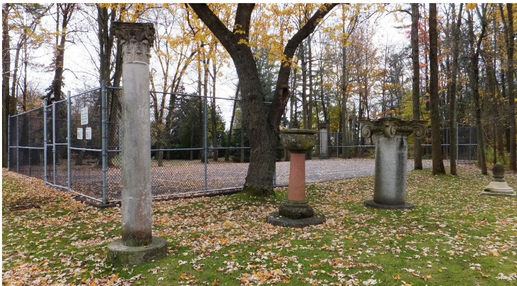
Architectural fragments (foreground) and the tennis courts (background). The applicant is proposing to relocate these fragments and remove the tennis court to allow for the construction of the new banquet hall addition.