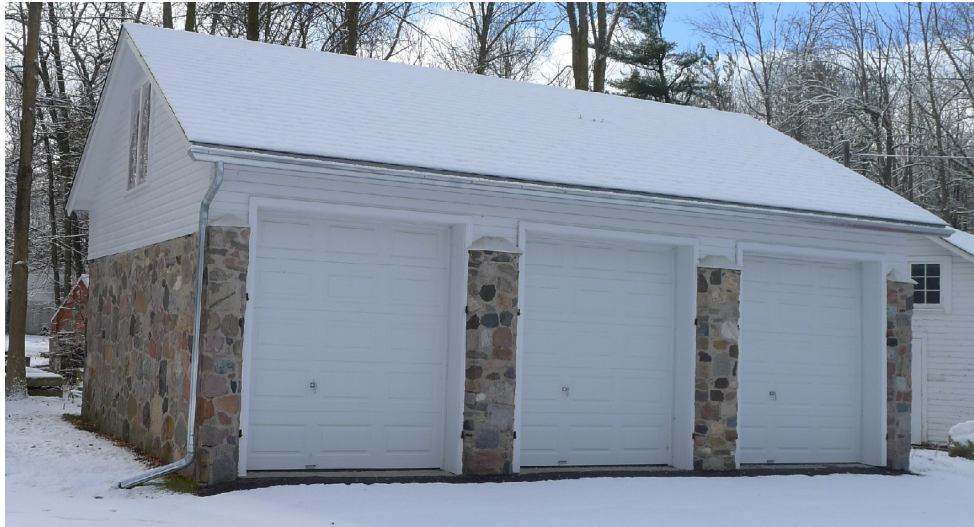
Garage Building, November 2013. The applicant is proposing that this building be demolished to allow for the construction of the new banquet hall addition.