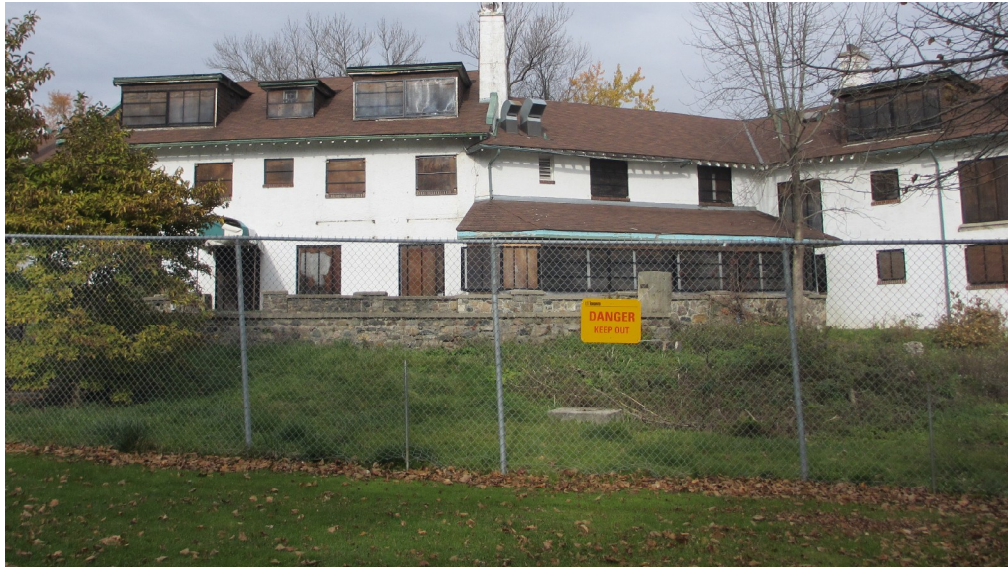
Bickford House, South Elevation, November 2013