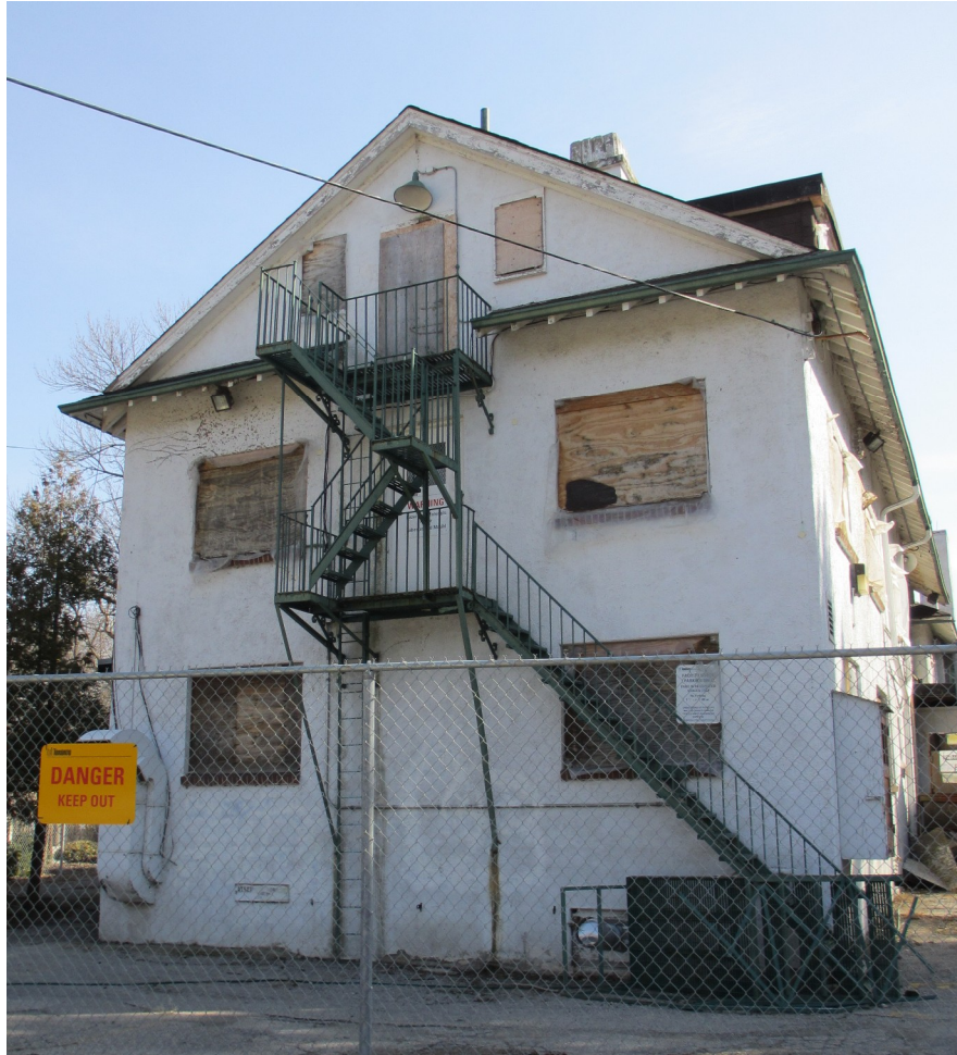
Bickford House, West Elevation, March 2012 illustrating the current condition of the building.