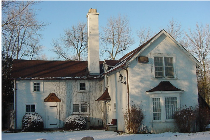
Studio Building December 16, 2002