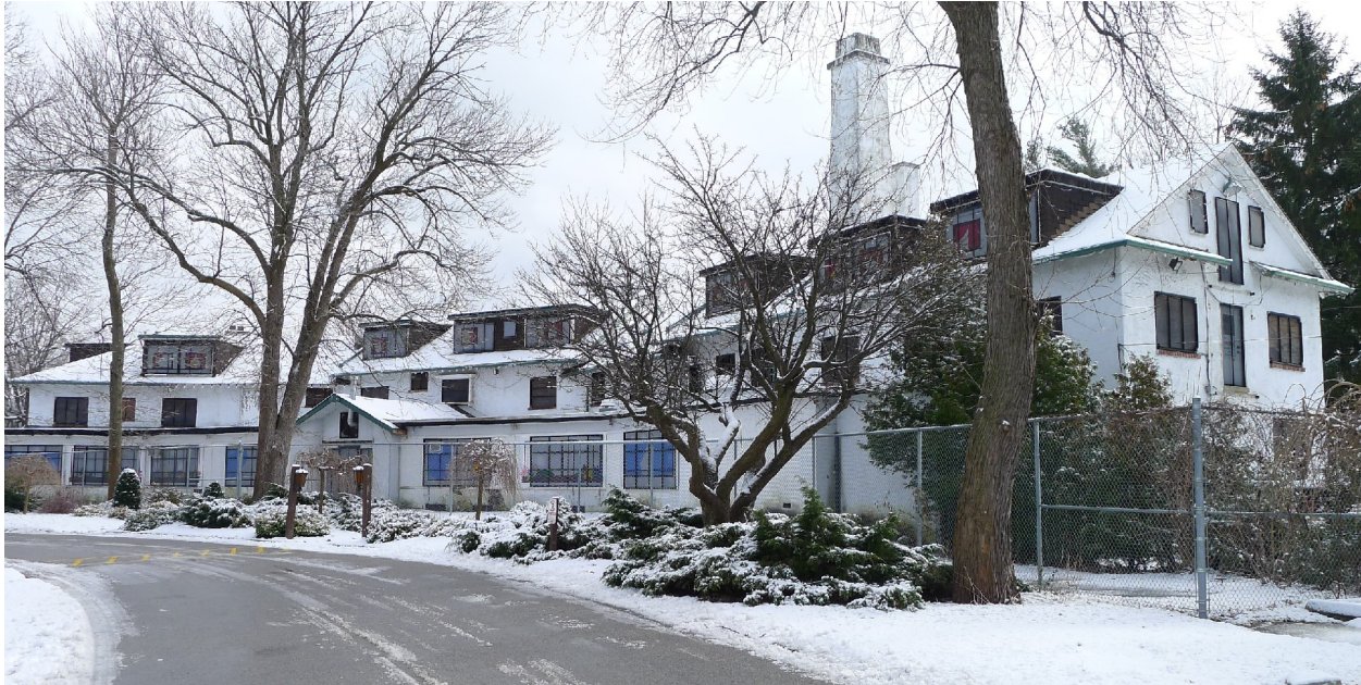
Bickford House, North Elevation, November 2013. The applicant is proposing to restore the Bickford House to its 1932 appearance. The lobby addition, later dormers, and east and west wings would be removed. The wood clad windows will be installed and the porte cochere will be restored.