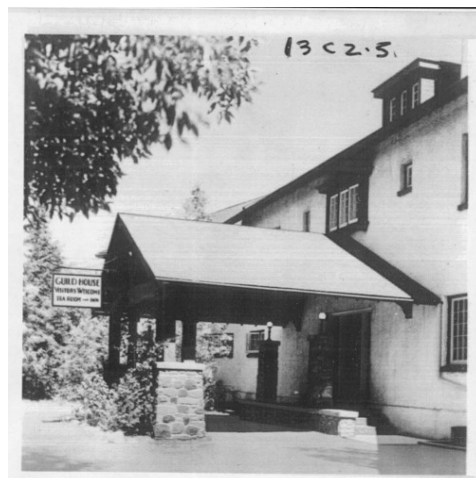
North Elevation of the Bickford House c. 1937 showing the original porte cochere.