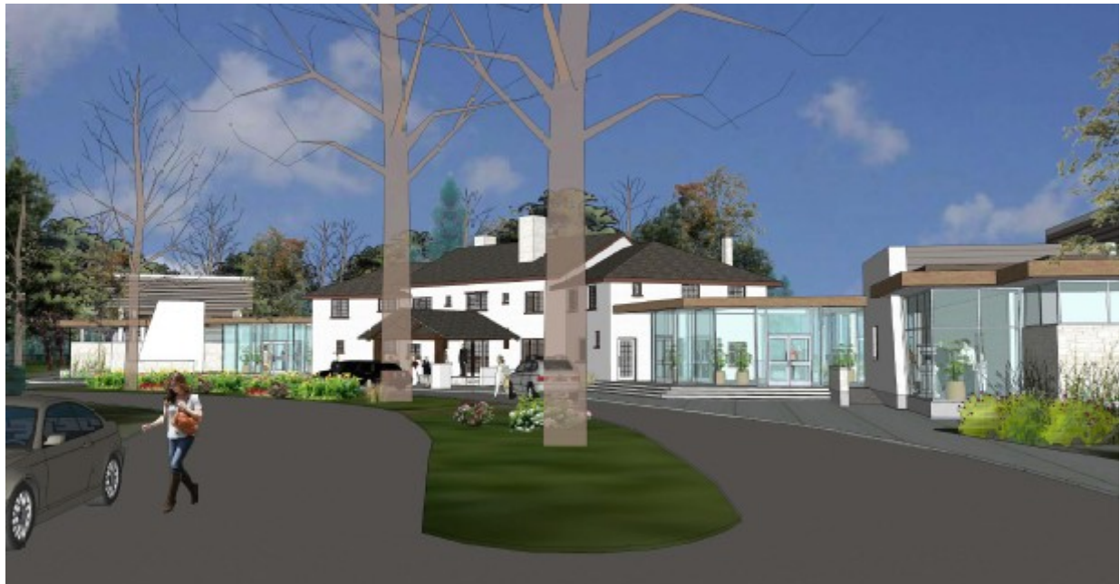
Renderings of the proposed north elevation showing the restored Bickford House and the glazed connecting elements leading to the proposed wing additions