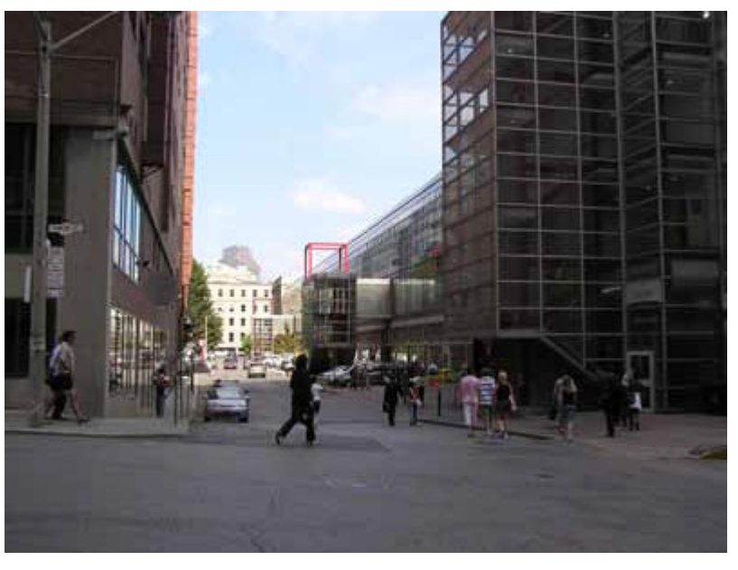
View Looking East down Station Street from Simcoe Street

CONTEXT PHOTOS - 7, 7A & 7B STATION STREET: 151 FRONT STREET WEST / 20 YORK STREET / 7, 7A & 7B STATION STREET & SKYWALK