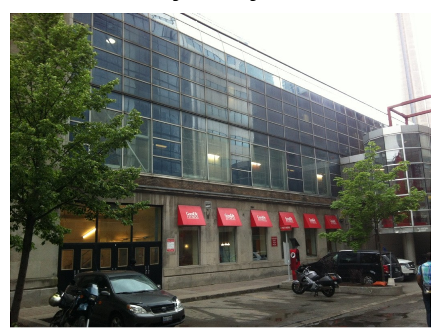
Remaining Stone Clad of Ground Floor of 7 Station Street

Demolition and Alteration of Designated Heritage Properties in the USHCD –151 Front Street West / 20 York Street / 7, 7A & 7B Station Street & Skywalk