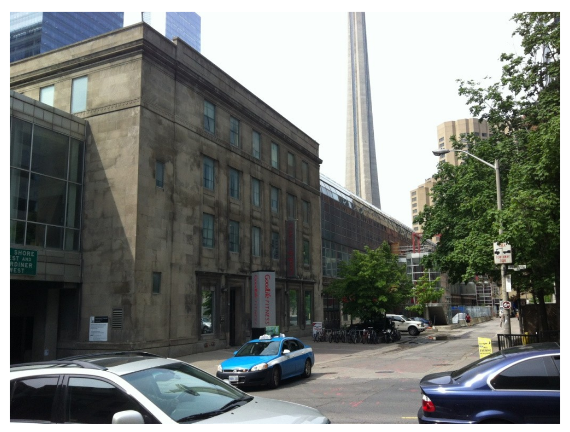
20 York Street