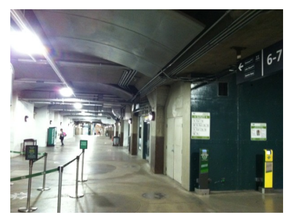
Looking South Within Teamway