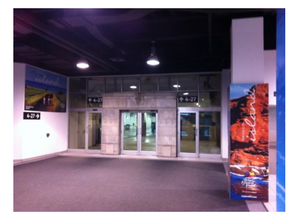
20 York Street Entrance Lobby

Demolition and Alteration of Designated Heritage Properties in the USHCD –151 Front Street West / 20 York Street / 7, 7A & 7B Station Street & Skywalk