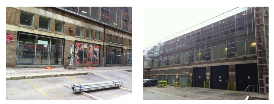
Remaining Portions of Ground Floor of Station Street Facade