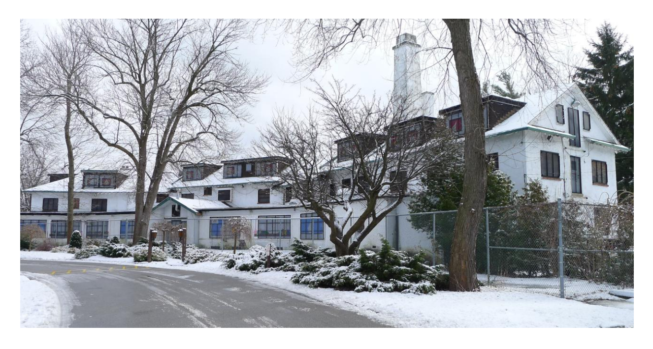
Bickford House, North Elevation, November 2013. The applicant is proposing to restore the Bickford House to its 1932 appearance. The lobby addition, later dormers, and east and west wings would be removed. The wood clad windows will be installed and the porte cochere will be restored.