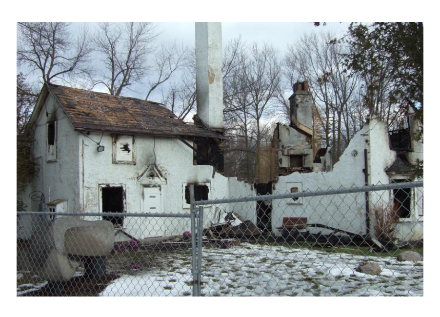
Studio Building following the catastrophic fire on December 25, 2008 that resulted in its demolition