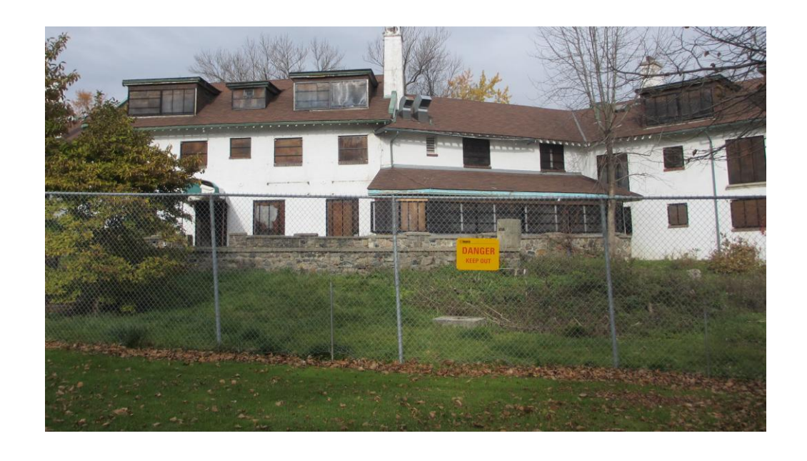
Bickford House, South Elevation, November 2013