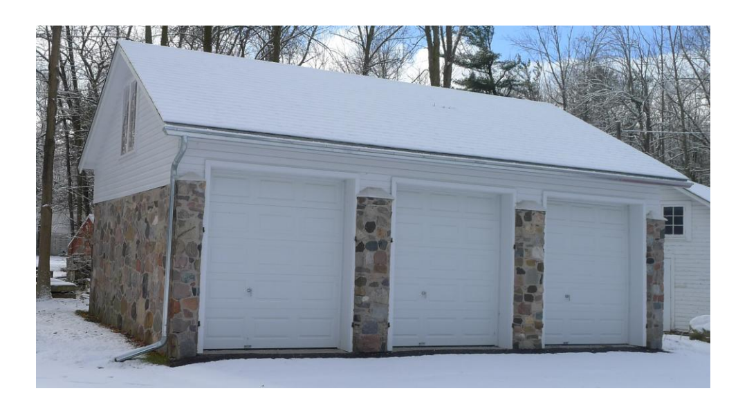
Garage Building, November 2013. The applicant is proposing that this building be demolished to allow for the construction of the new banquet hall addition.