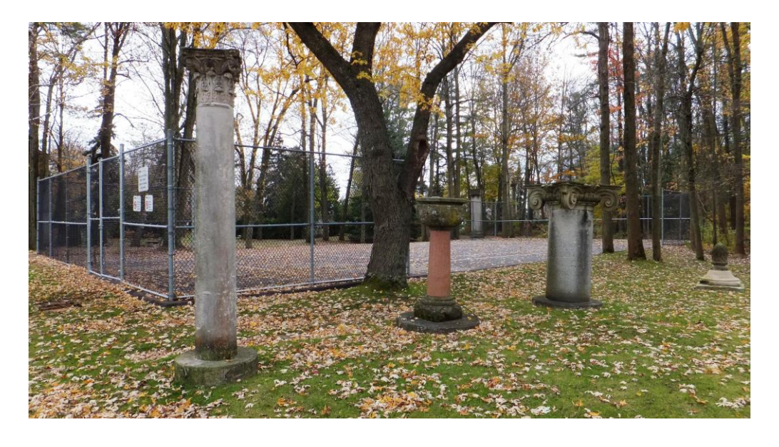
Architectural fragments (foreground) and the tennis courts (background). The applicant is proposing to relocate these fragments and remove the tennis court to allow for the construction of the new banquet hall addition.