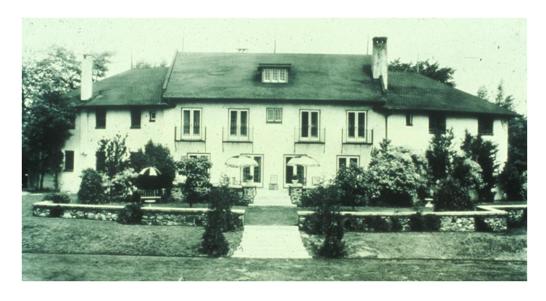
Bickford House, South Elevation c. 1932