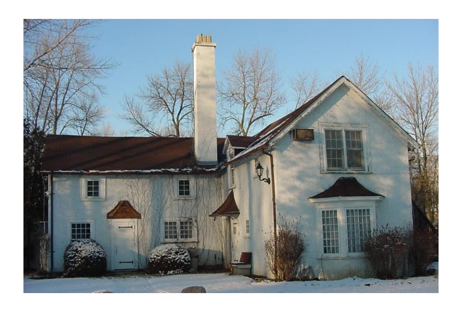
Studio Building December 16, 2002