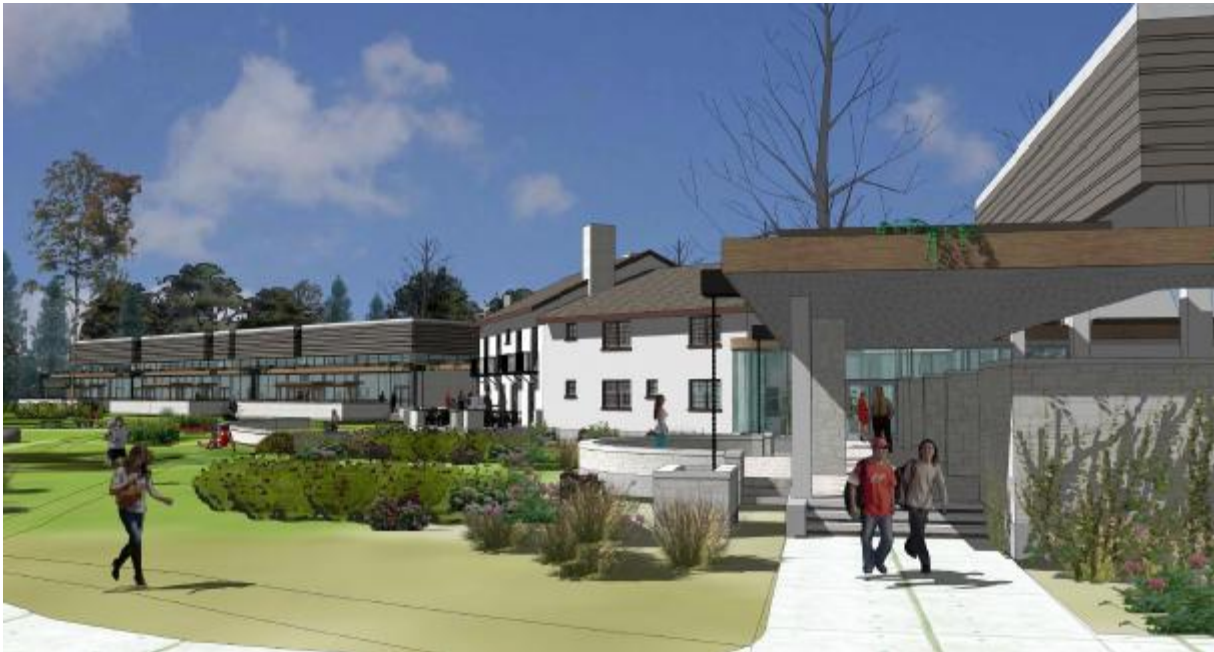
Rendering of the proposed south elevation showing the restored Bickford House and the proposed wing additions