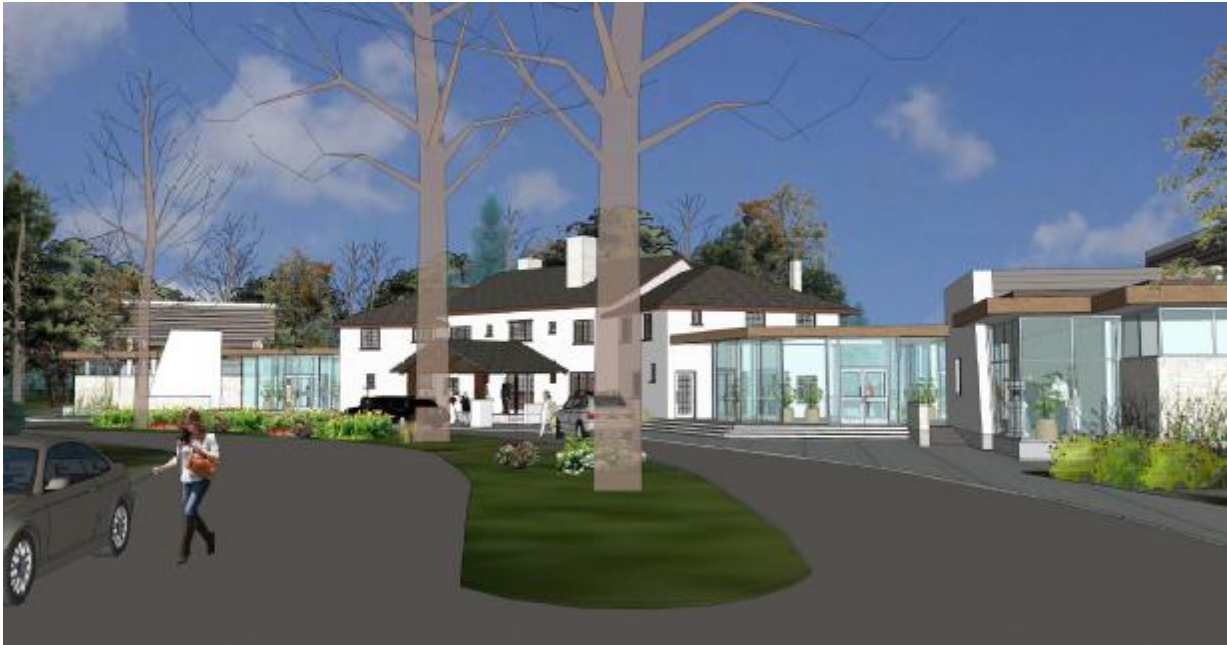
Renderings of the proposed north elevation showing the restored Bickford House and the glazed connecting elements leading to the proposed wing additions