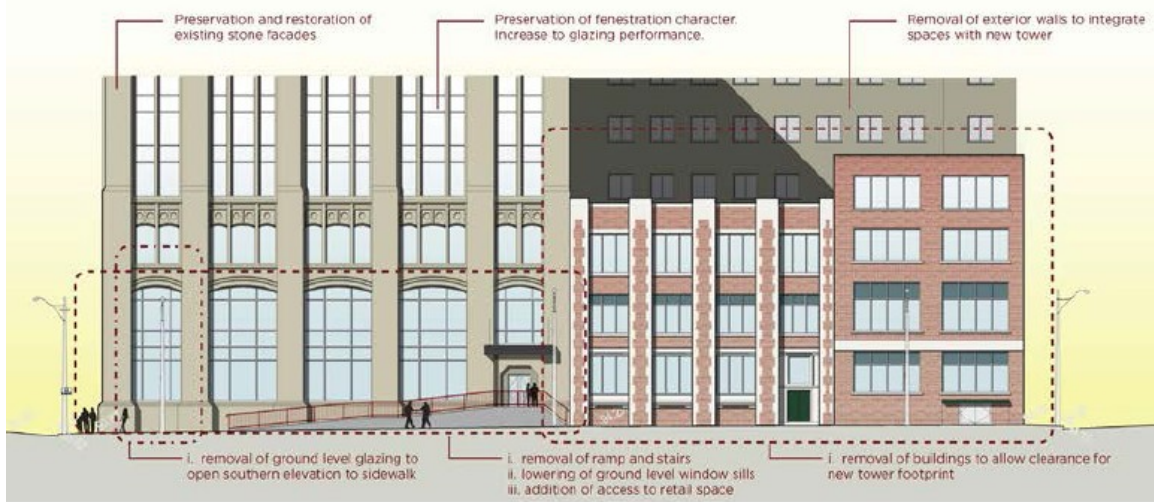
Existing East Elevation (Centre Avenue)