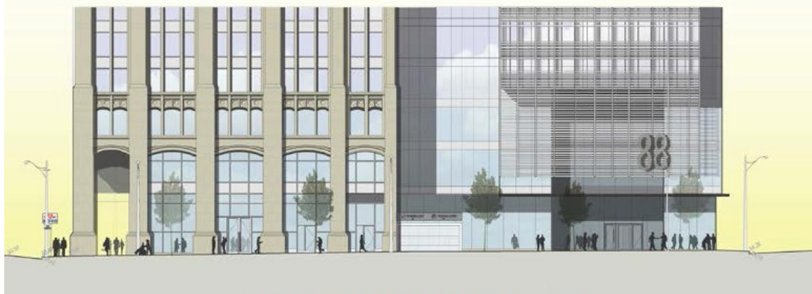
Proposed East Elevation (Centre Avenue)