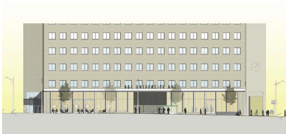
Proposed West Elevation (University Avenue)