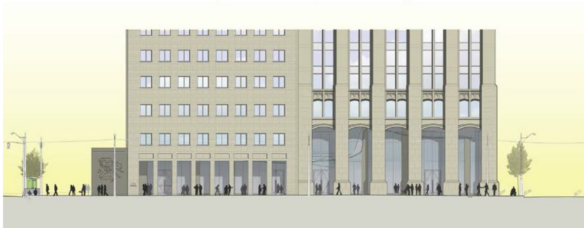
Proposed South Elevation (Dundas St. West)