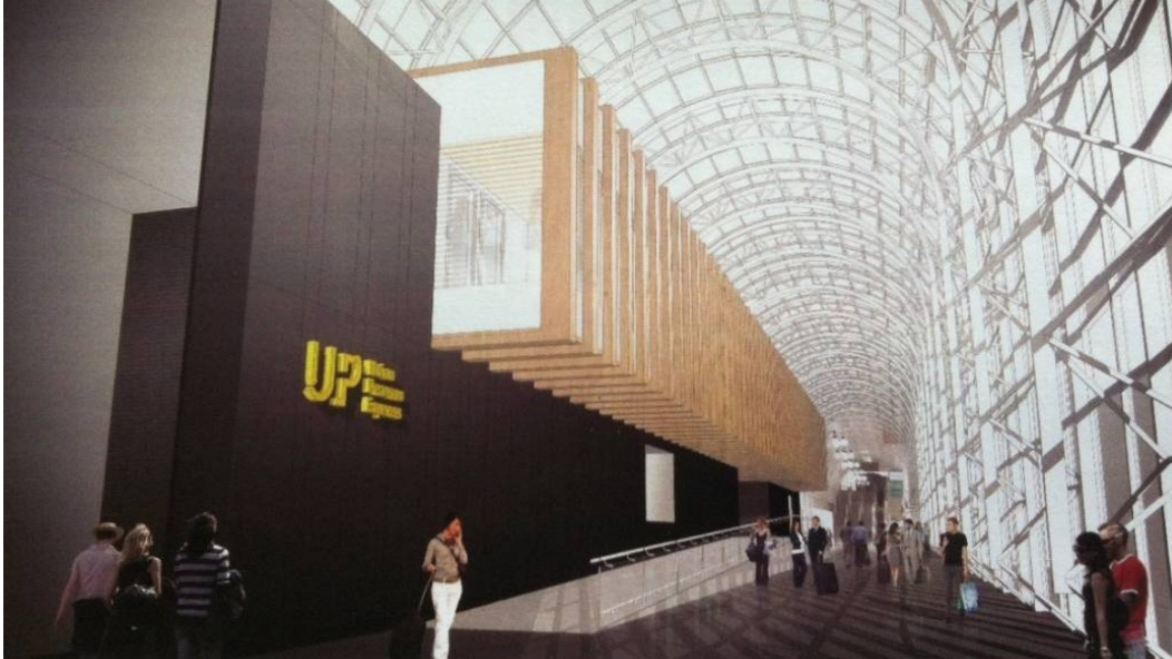
View Looking West Entering Skywalk from Union Station