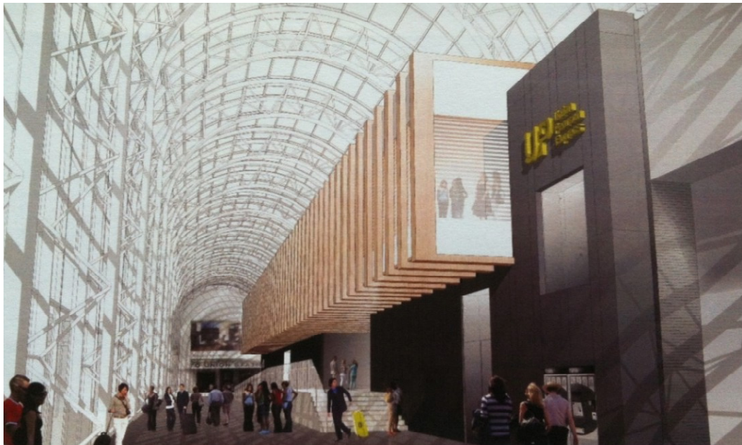
View Looking East within Skywalk towards Union Station