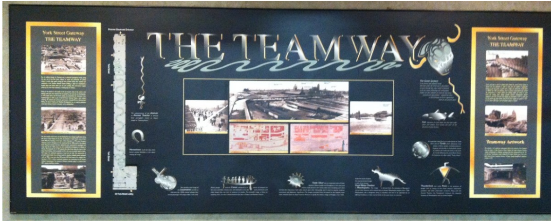
York Teamway Interpretation Panel