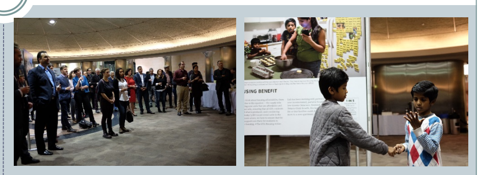
Exhibit and Reception