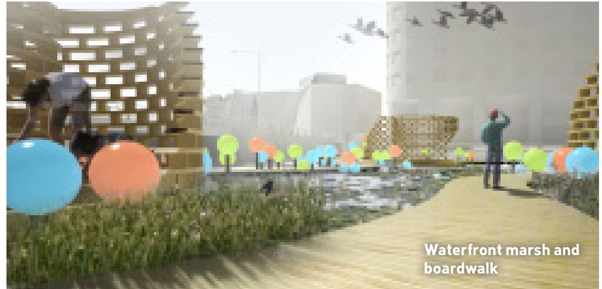
Waterfront marsh and boardwalk