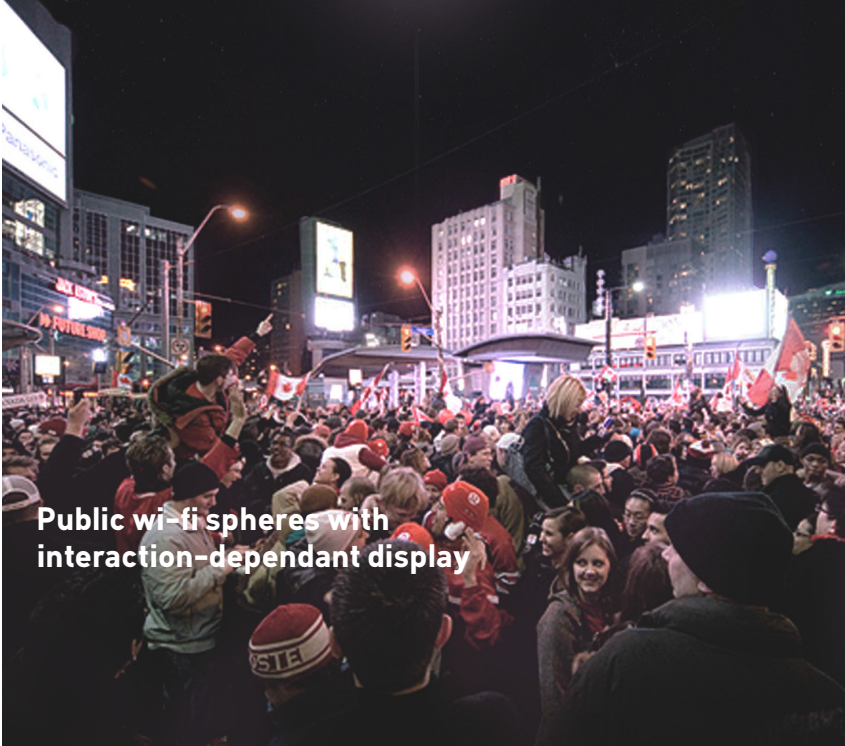
Public wi-fi spheres with interaction-dependant display

Mobile augmented reality for future development and civic improvement plans