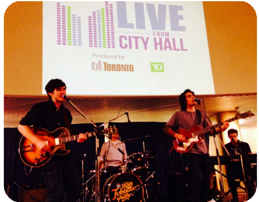
Ferraro Live at City Hall