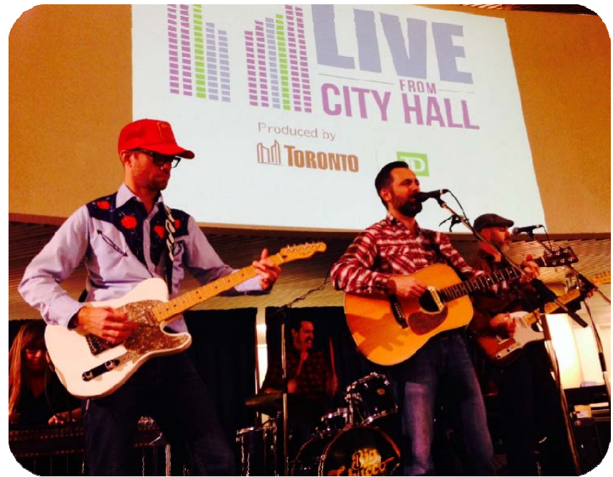
Big Tobacco & The Pickers Live From City Hall