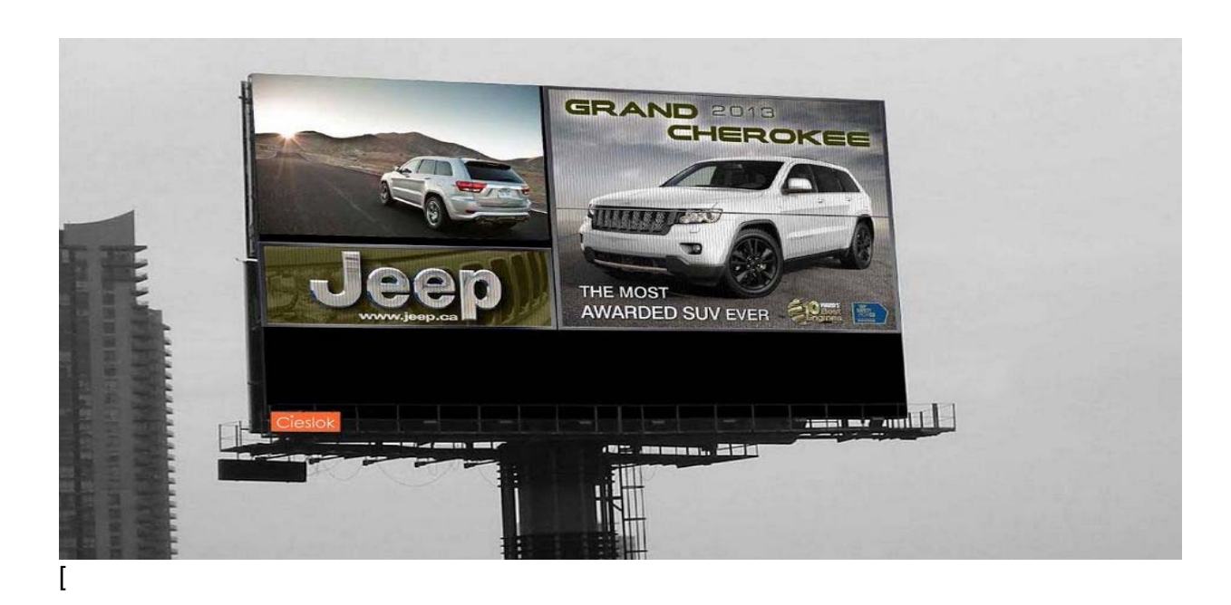
Appendix "C" Visual of Configuration on both East Side & West Side After Changes