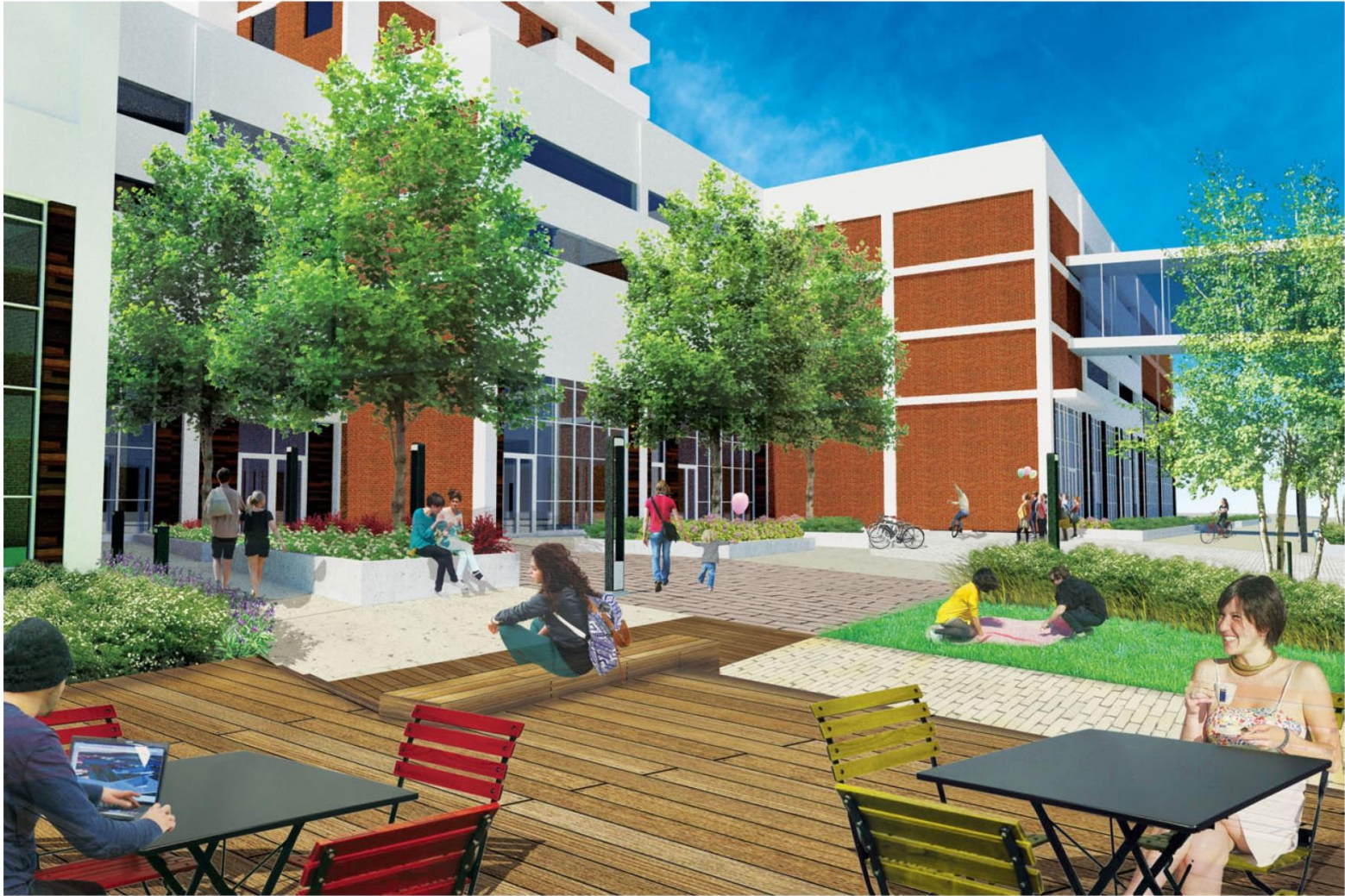
VIEW 2 - ARTIST'S COURTYARD