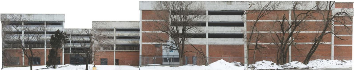
EXISTING BUILDING FAÇADE