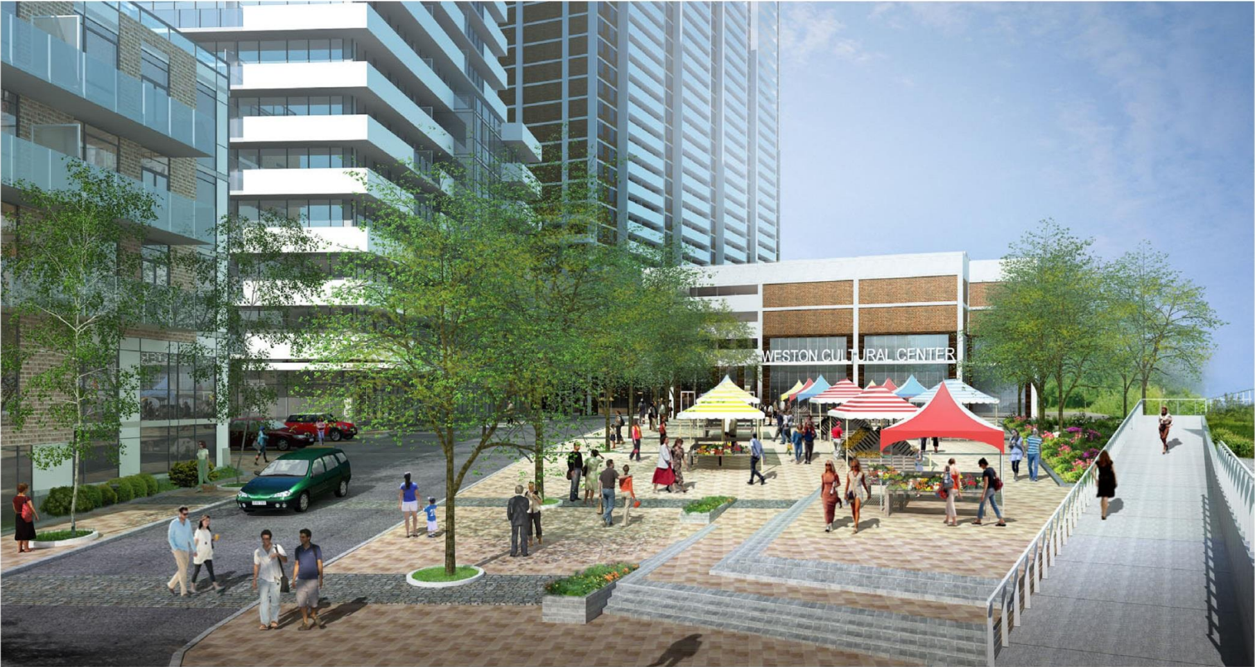
VIEW 3 - WESTON PLACE