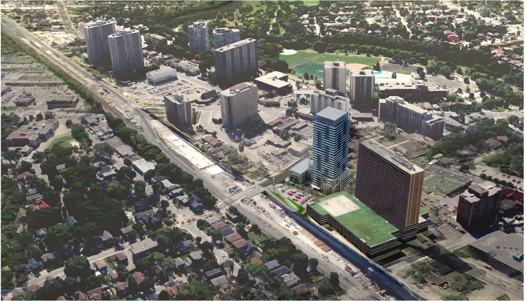
3D CONTEXT - AERIAL LOOKING NORTHWEST