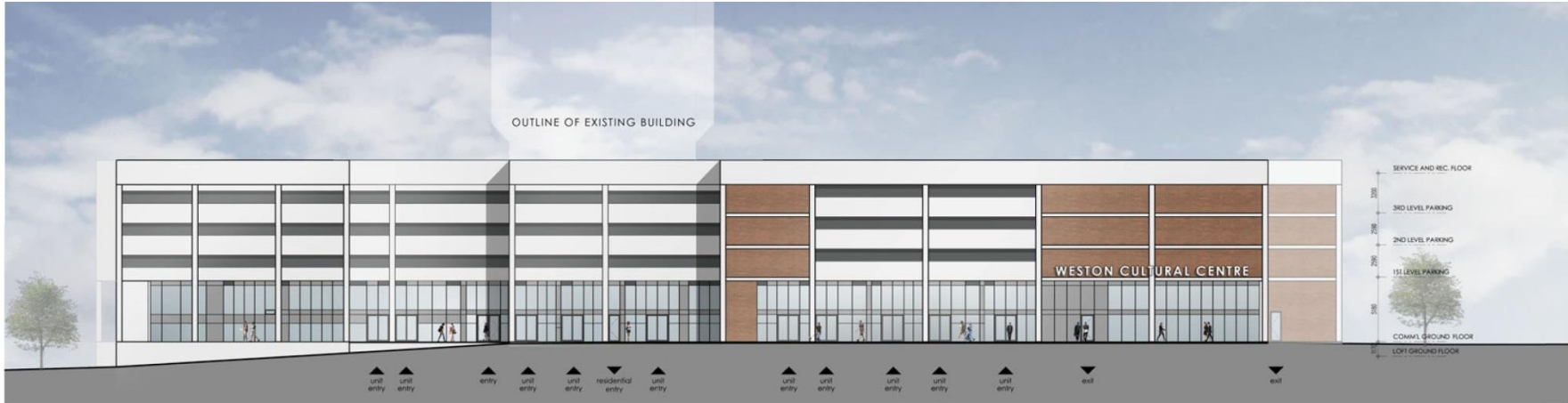
PROPOSED CONCEPTUAL BUILDING FAÇADE

33 KING STREET, WESTON (TORONTO, ON) - SOUTH ELEVATION