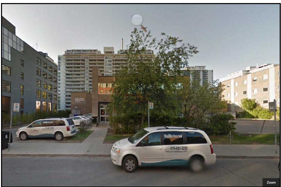
Appendix B – Below Market Rent Lease Agreement at 140 Merton St