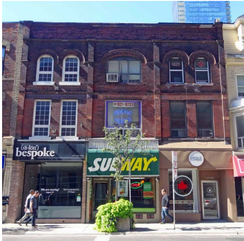
846-848A Yonge Street (James Weir Buildings)