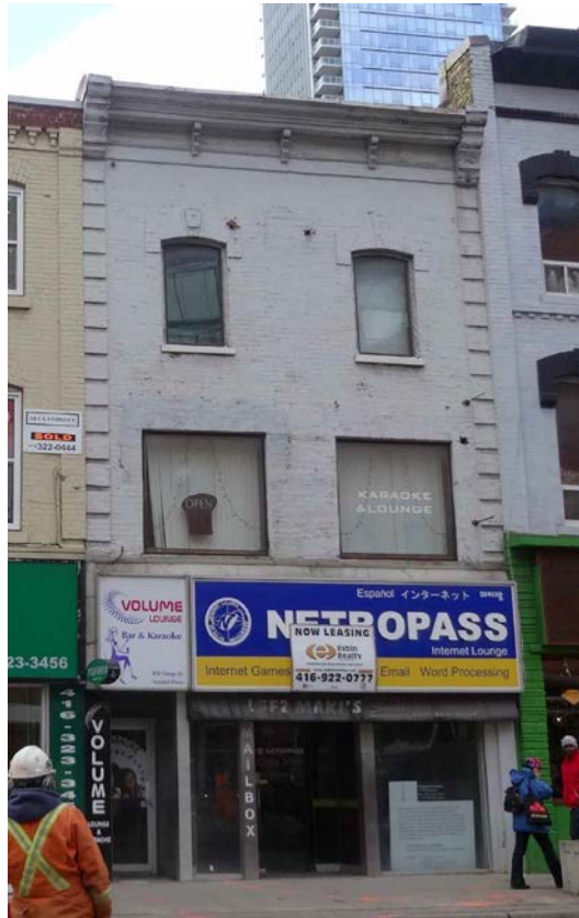
836 Yonge Street (John Oram Building)