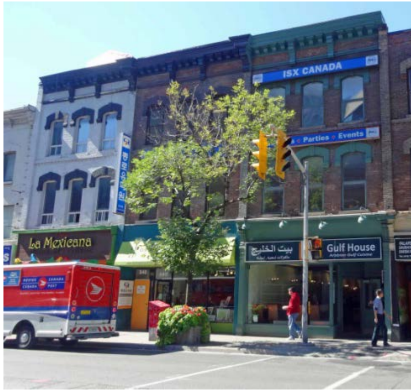
838-844 Yonge Street (Moses Staunton Buildings)