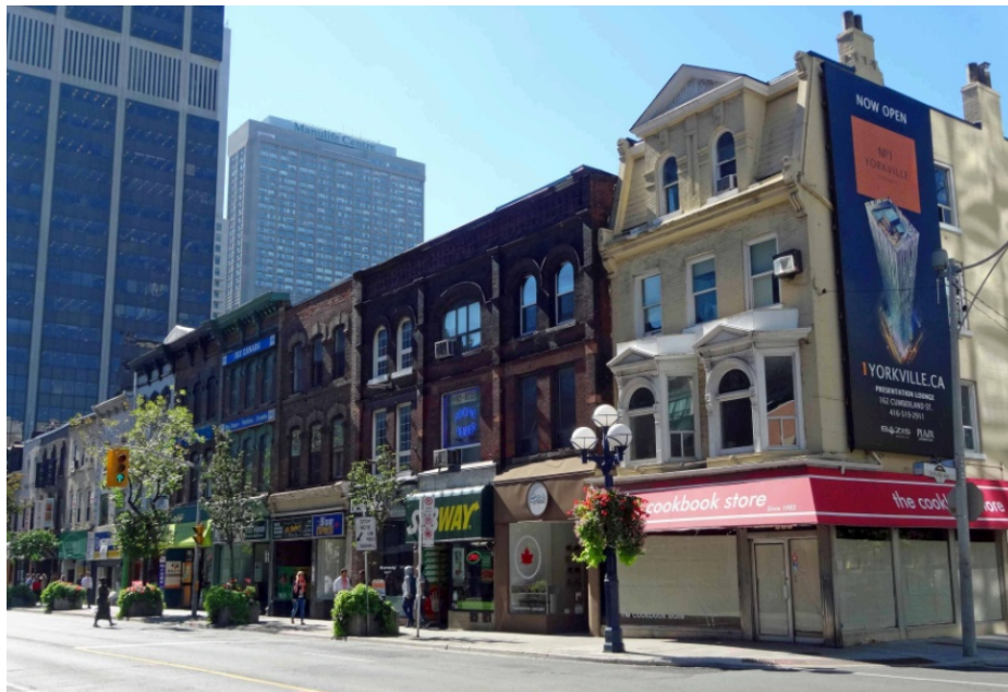
850 Yonge Street (1 Yorkville Avenue) anchors the north end of the intact group of late 19 th century buildings in the block between Cumberland Street and Yorkville Avenue