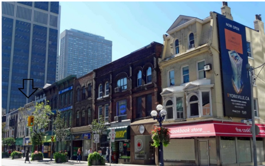
The arrow marks the location of 836 Yonge Street as part of the group of intact 19 th century buildings in the block between Cumberland Street and Yorkville Avenue