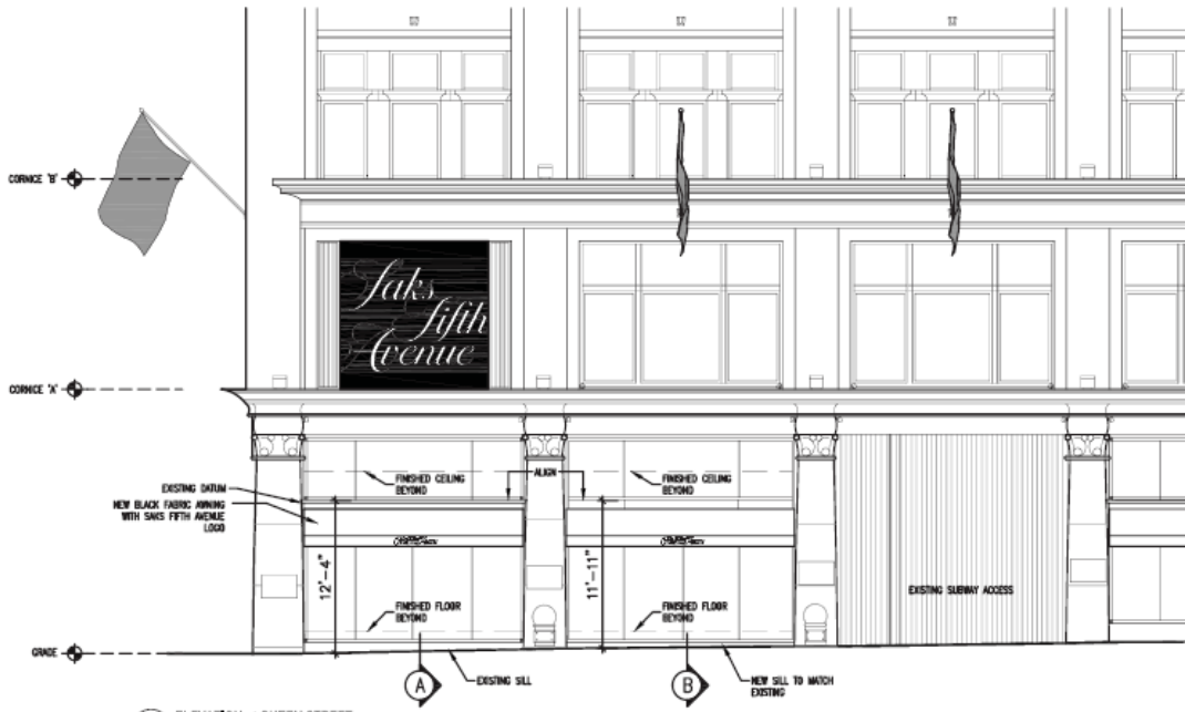
2 ELEVATION at QUEEN STREET SCALE: 1/8" = 1'-0"