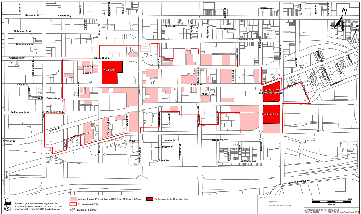
Map 29: Areas of Archaeological Potential and Archaeologically Sensitive Areas within the HCD