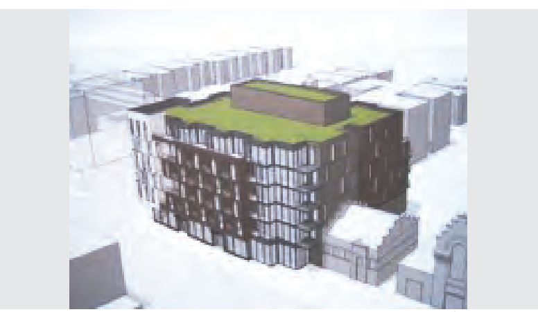
Facade along Queen Street East (Rendering)

Rear Setback (Including Lane or Driveway): 7.5 m