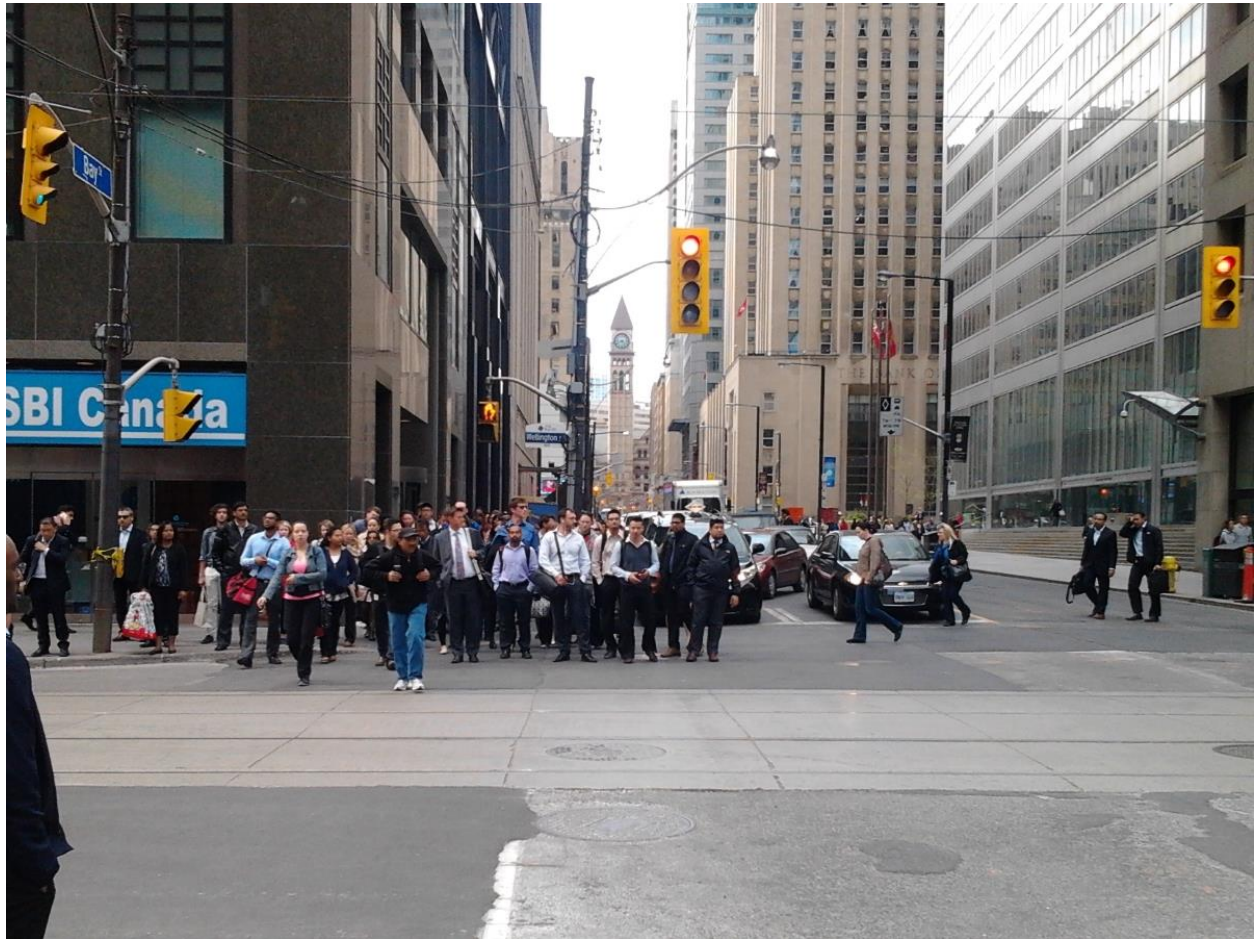
[Image 1] Northwest corner of Bay St. and Wellington St. during peak evening hour