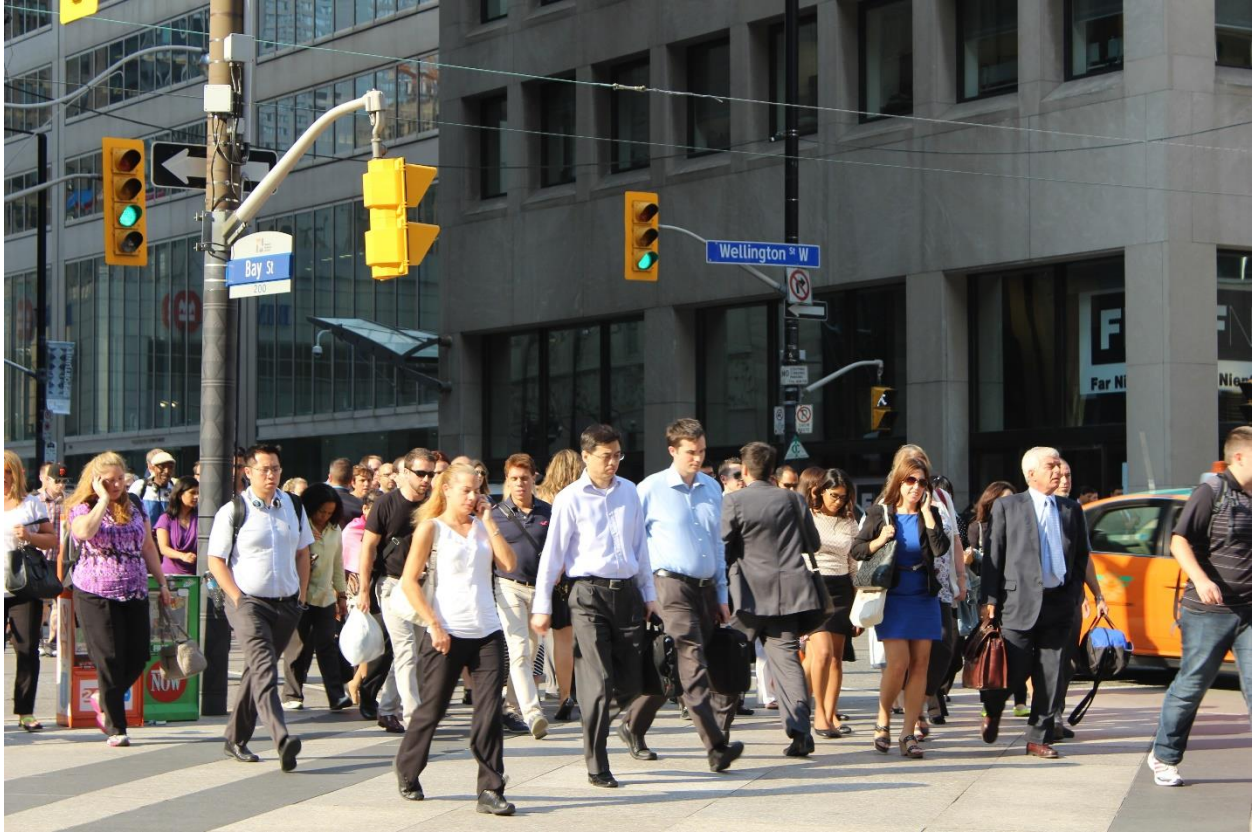
[Image 3] Southwest corner of Bay St. and Wellington St. during peak evening hour