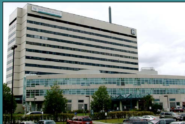
Rouge Valley Centenary (RVC)