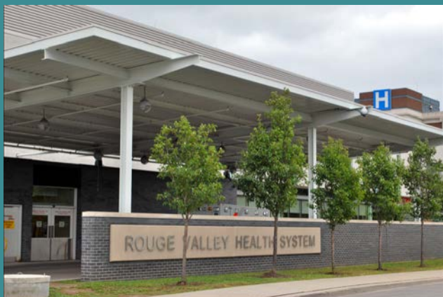
Rouge Valley Ajax and Pickering (RVAP)