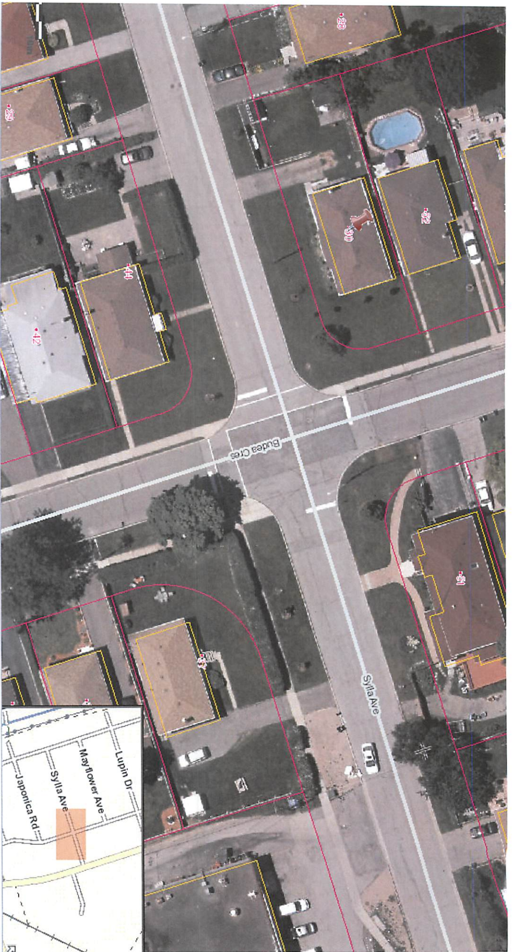
Appendix 8 – 30 Sylla Ave, Aerial View