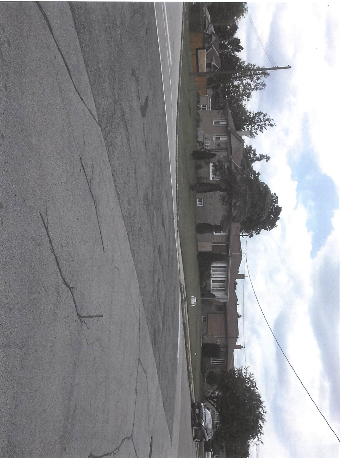
Appendix 5 – 30 Sylla Ave., View of Front and Side of Dwelling (Flankage and Front Yards), While Facing Northwest from Southeast Corner of Intersection of Sylla Avenue and Budea Crescent