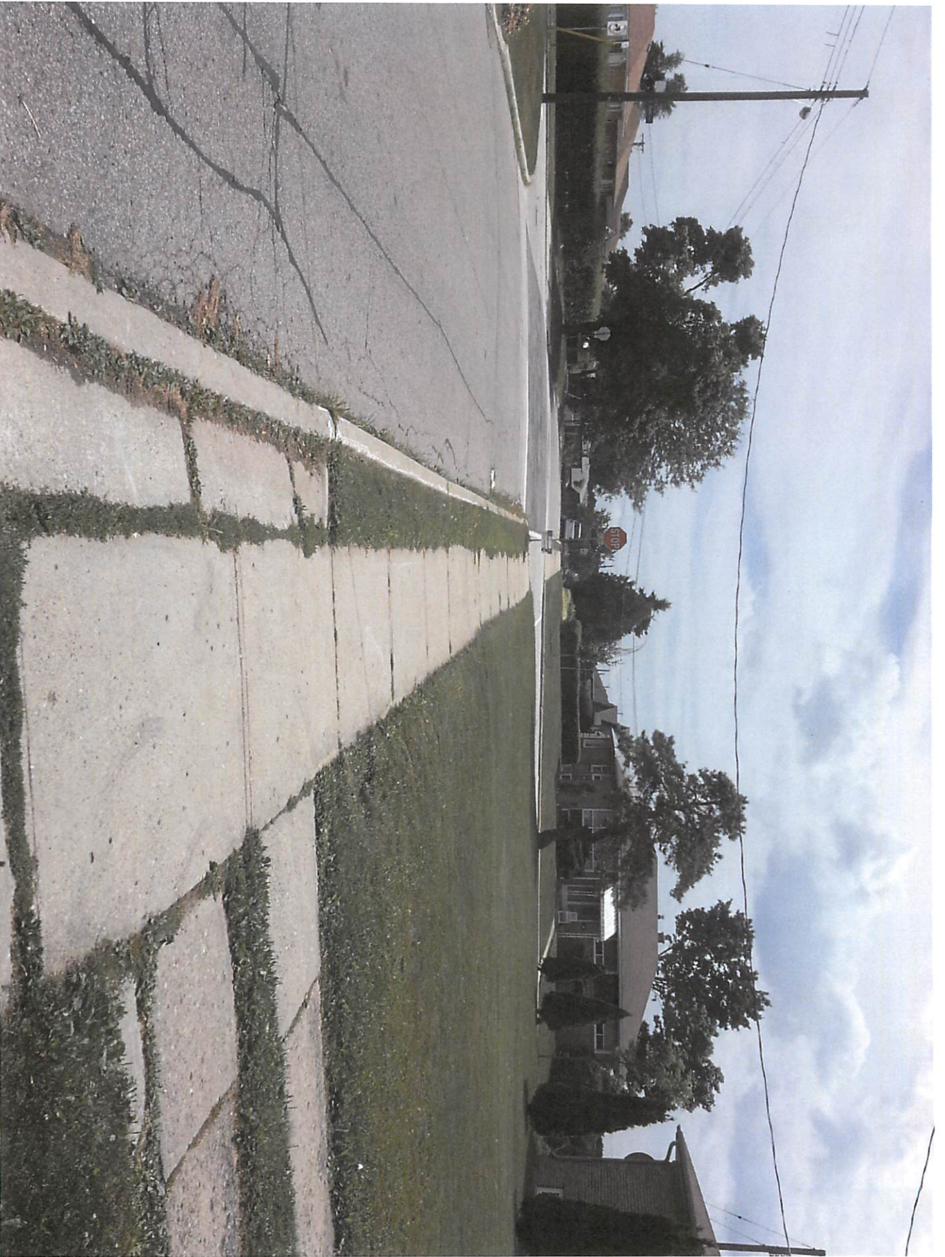
Appendix 7 – 30 Sylla Ave., View of Side of Dwelling (Flankage Yard), from sidewalk in front of adjacent dwelling to the North, while facing South