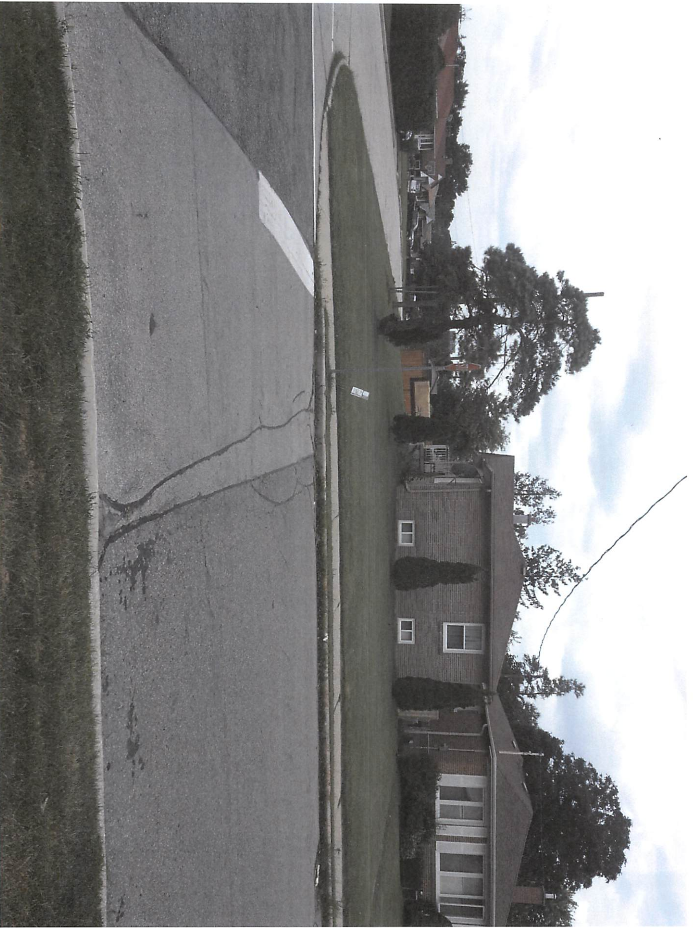
Appendix 6 – 30 Sylla Ave.; View of Side of Dwelling (Front Yard), While Facing West from Dwelling Across the Street on the Northeast Corner of Intersection of Sylla Avenue and Budea Crescent