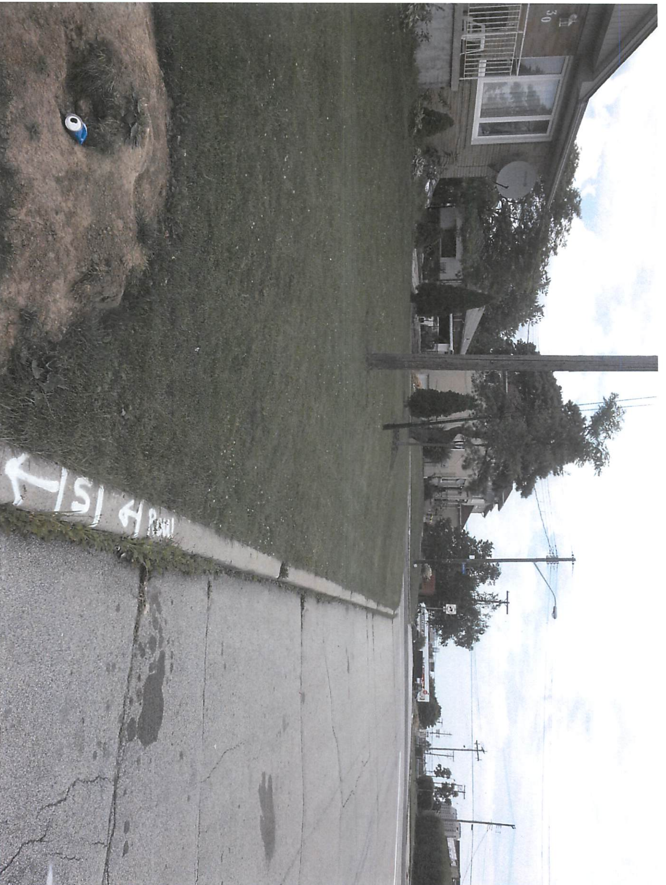
Appendix 3 – 30 Sylla Ave, Photograph #3 of Front of Dwelling (Flankage Yard); View from North Side of Street, While Facing East