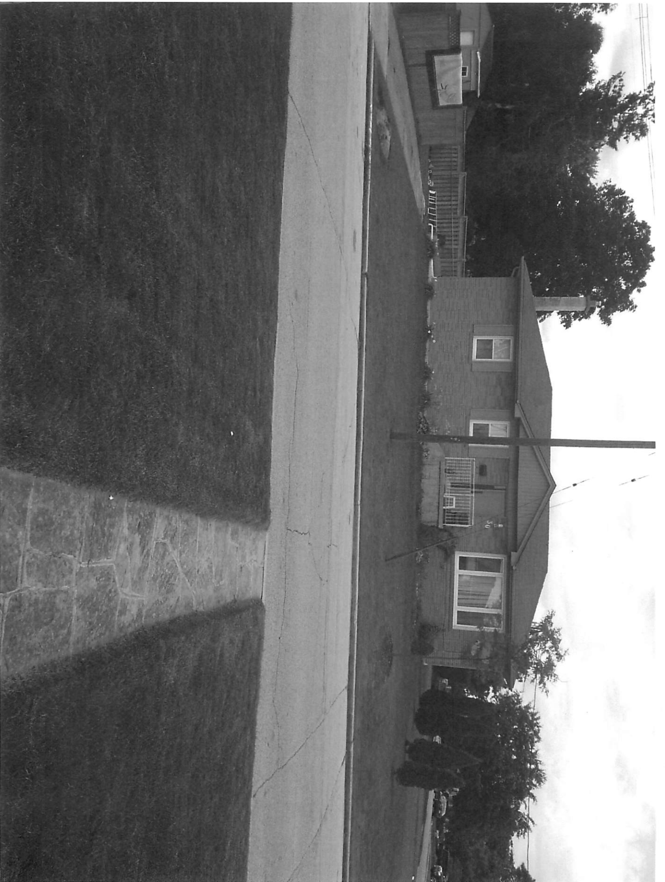
Appendix 1 – 30 Sylla Ave., Photograph #1 of Front of Dwelling (Flankage Yard); View While Facing North, from Dwelling Across the Street, to the South