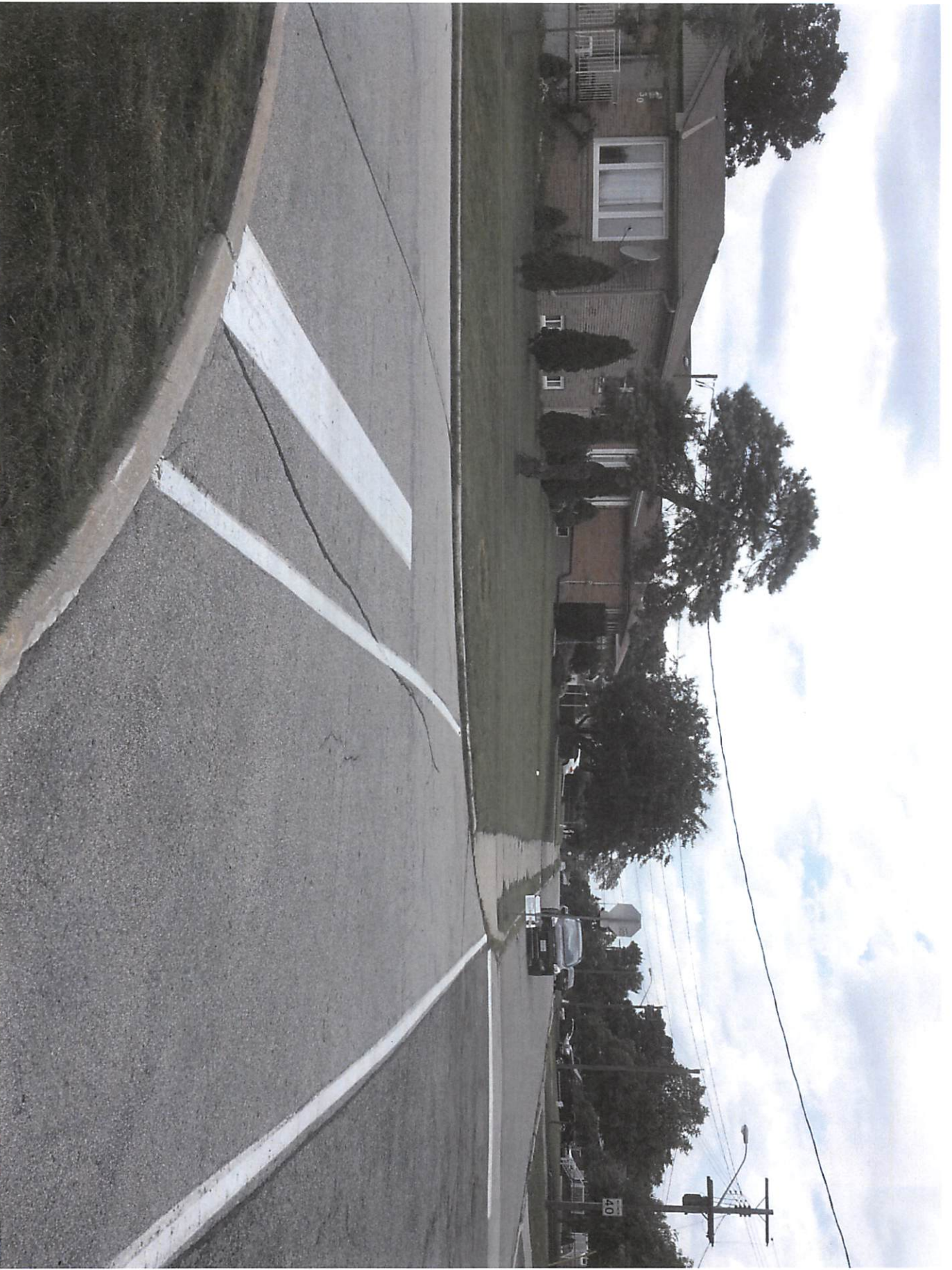
Appendix 4 – 30 Sylla Ave, View of Side of Dwelling (Front Yard), While Facing North from Southwest Corner of Intersection of Sylla Avenue and Budea Crescent