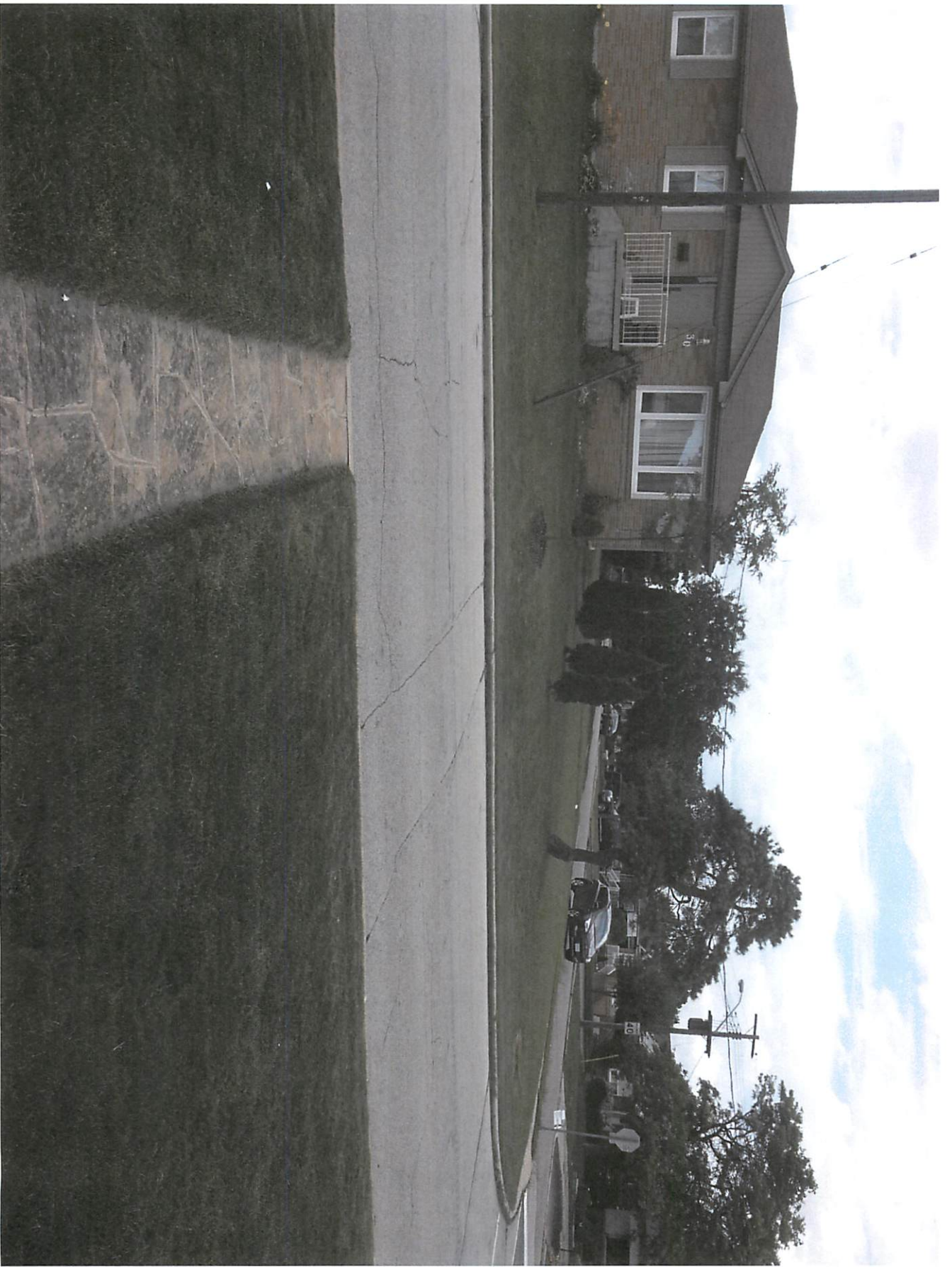
Appendix 2 – 30 Sylla Ave., Photograph #2 of Front of Dwelling (Flankage Yard); View While Facing North, from Dwelling Across the Street, to the South