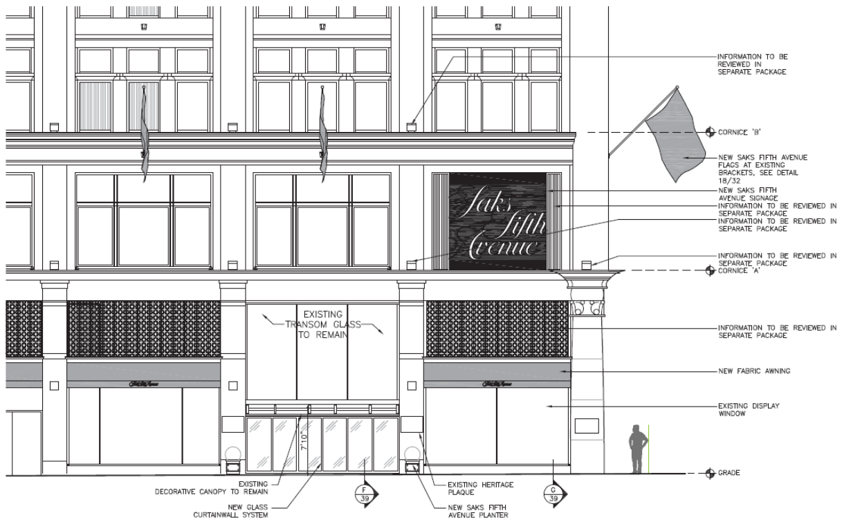
Richmond and Yonge Street Lobby – Richmond Street