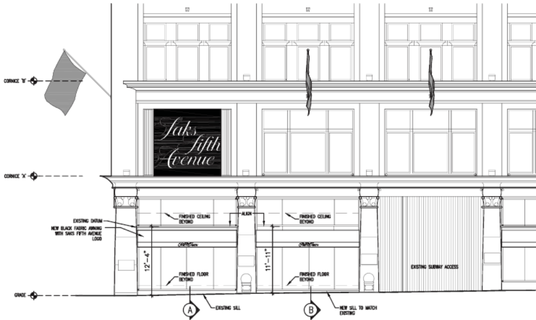
2 ELEVATION at QUEEN STREET SCALE: 1/8" = 1'-0"