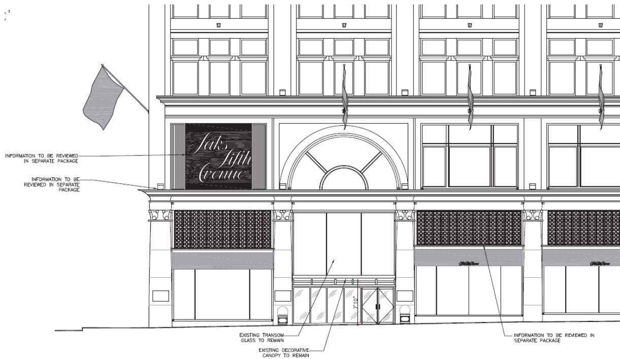
Richmond and Yonge Street Lobby – Yonge Street Entrance