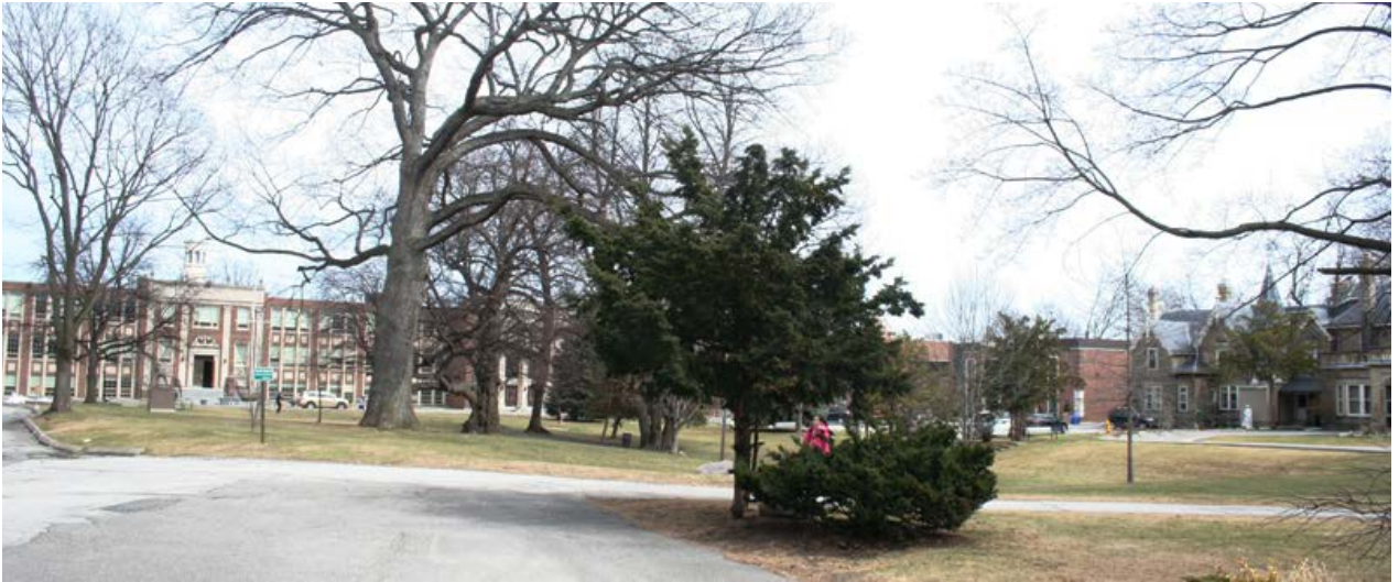
7. View of Upper Terrace Gounds from Avenue Road looking east across open grounds and landscaping towards De La Salle College "Oaklands" building.