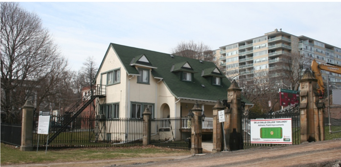
2. Stone gates with the gatekeeper's house ( Heritage Preservation Services, 2015 )