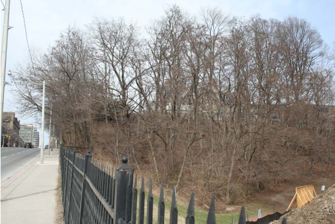
5. Oaklands, south façade and the Lake Iroquois ridge with the playing fields below as viewed from Avenue Road