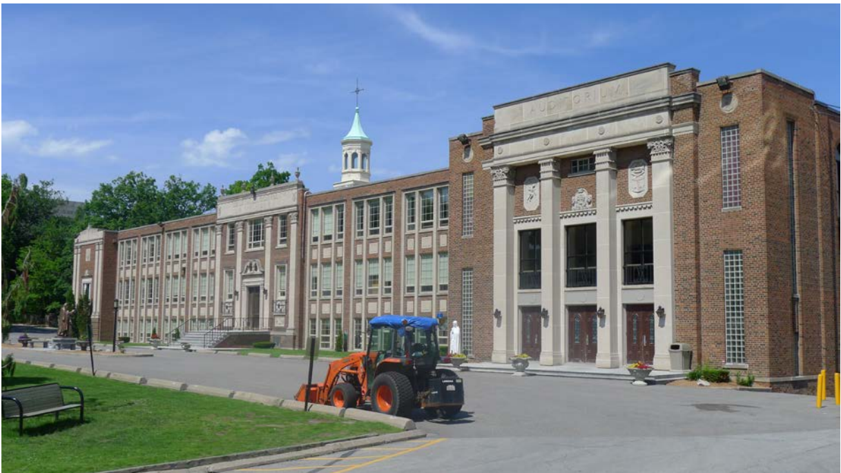
6. West Façade, De La Salle "Oaklands", 1949 ( Heritage Preservation Services, 2015 )