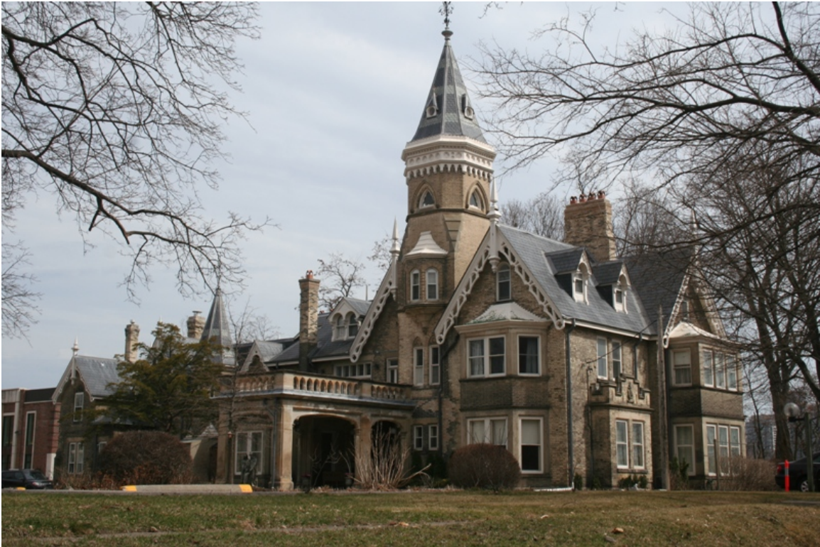
1. The view of the north and west façades of Oaklands from Avenue Road, 131 Farnham Avenue