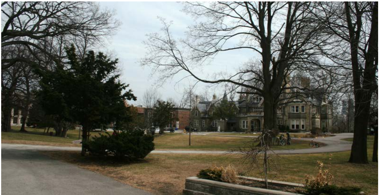
8. View of Upper Terrace Grounds from Avenue Road looking south-east across open grounds and landscaping towards Oaklands. ( Heritage Preservation Services, 2015 )