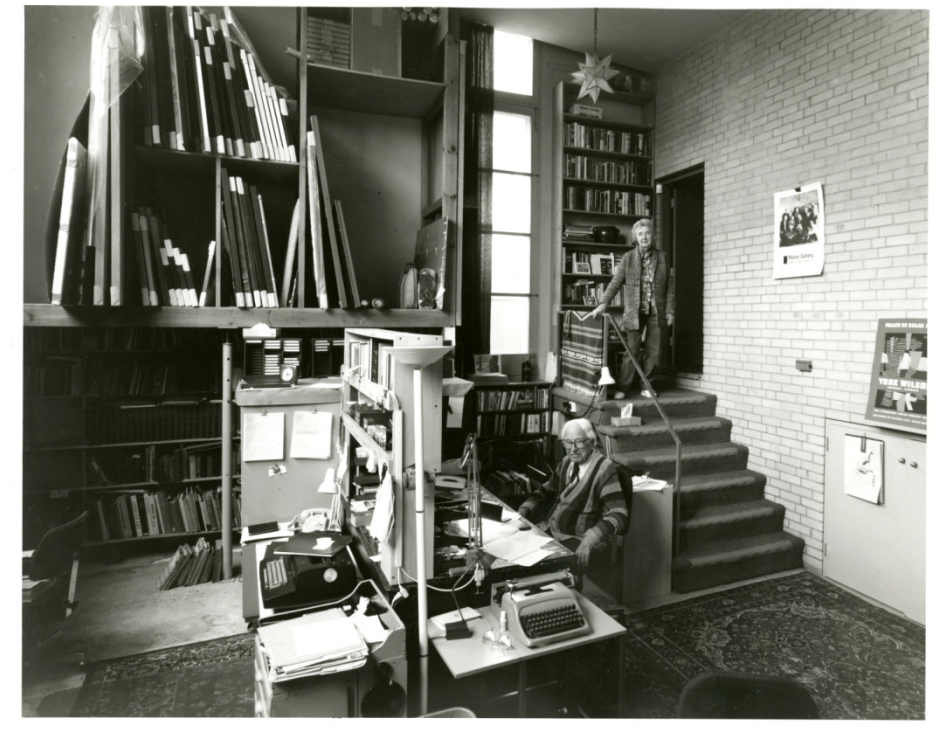
Interior Studio, Looking East