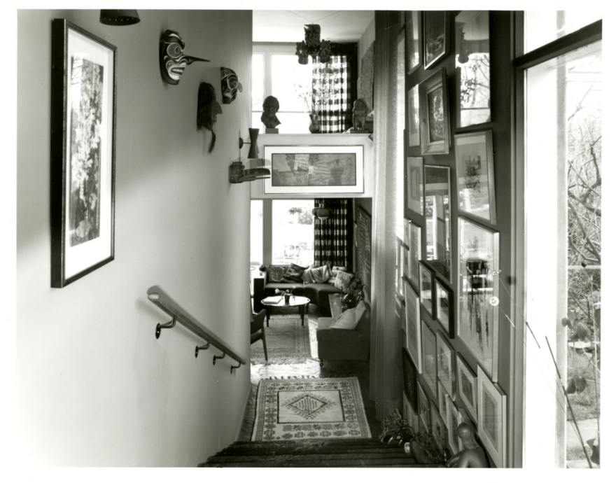
Open staircase leading to Living Room from front door, West side