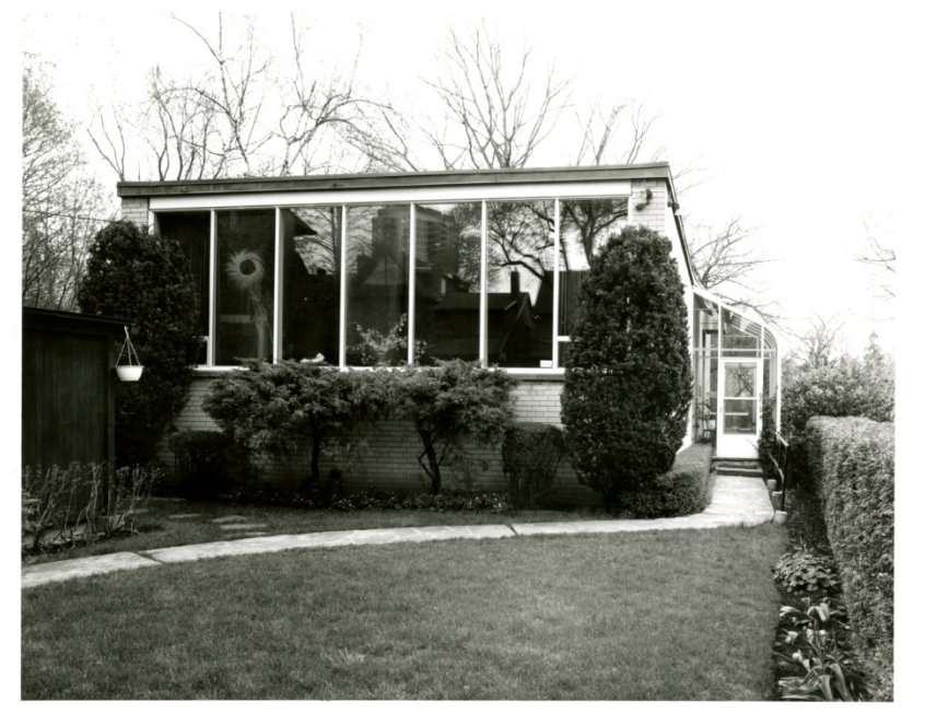
Front (North) Elevation