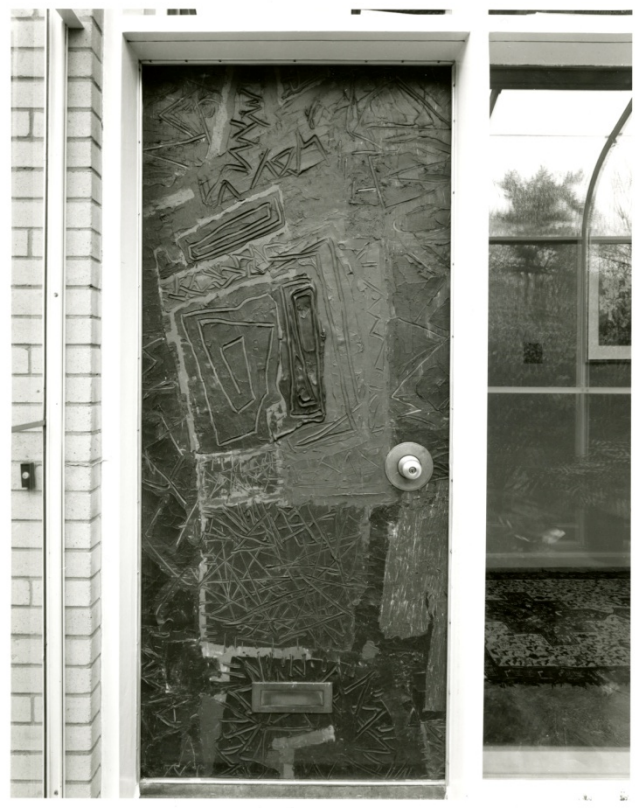
Entry Door, West Elevation