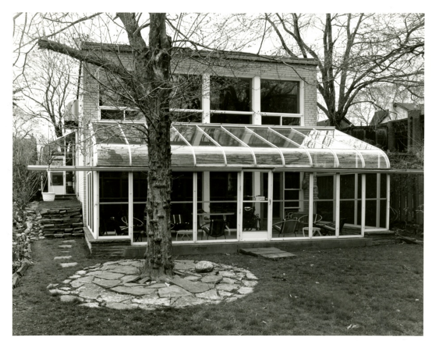
Rear (South) Elevation