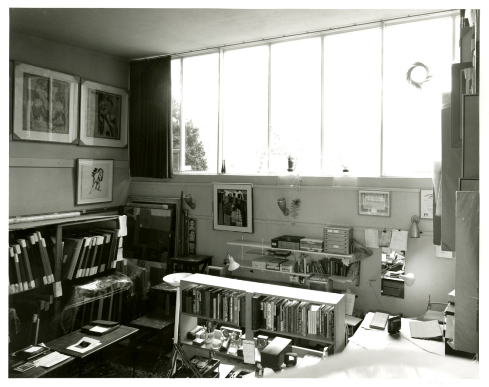
Interior Studio, Looking North