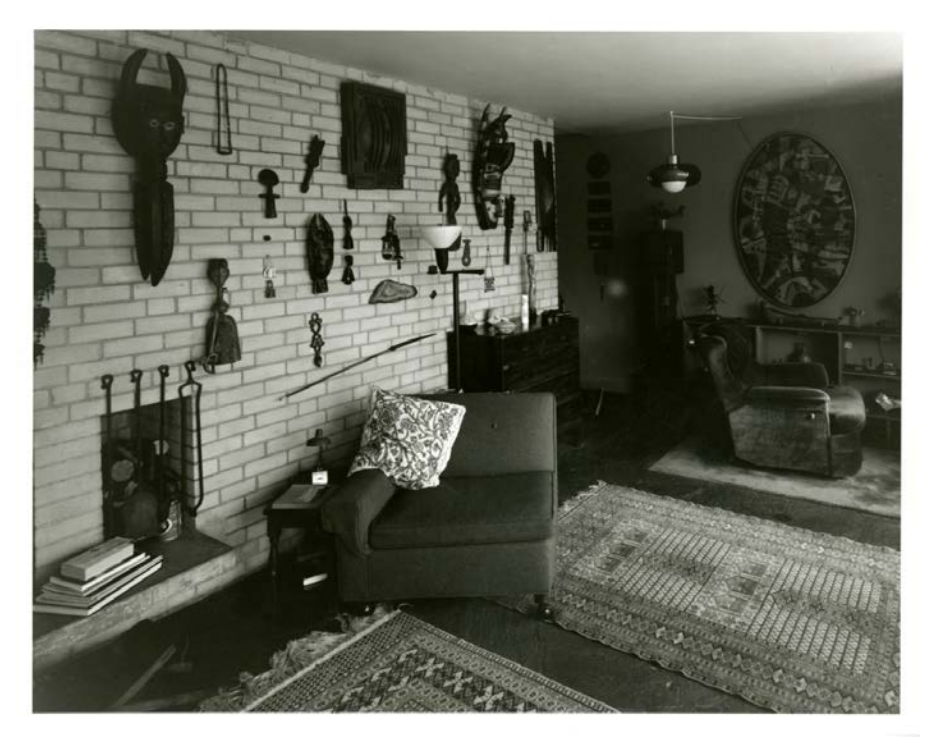
Combination Living and Dining Room, showing brick (North) wall with fireplace and cantilevered stone hearth