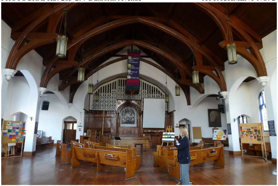
Showing the interior of the church, looking south towards the baptistery, with the Owen Staples war memorial painting at the right in the transept.