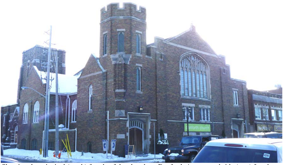
Showing the principal (north) façade of the church on Danforth Avenue and side (east) façade on Bowden Street with the Sunday school on the left (Heritage Preservation Services, 2015)