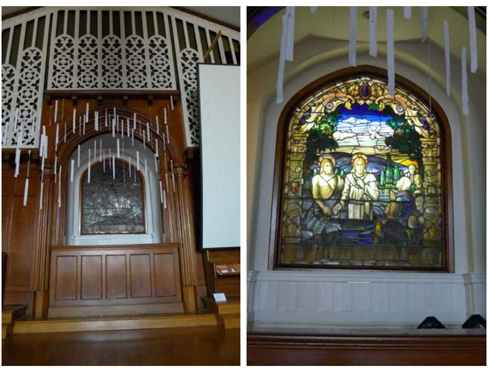
Showing the interior of the church, with the baptistery and stained glass window (Heritage Preservation Services, 2015)