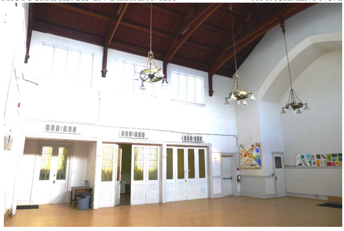
Showing the interior of the Sunday school auditorium, 1911 (Heritage Preservation Services, 2015)