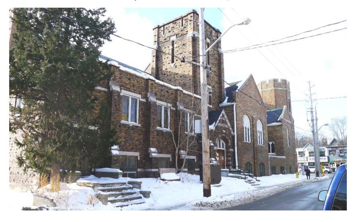
Showing the side (east) façade on Bowden Street with the Sunday school, 1911, on the left and the church, 1931, beyond on the right