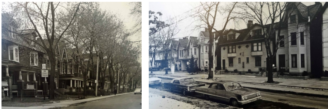
Markham Street, east side, 1962, looking south from Bloor (left) and north from Lennox (right) before the opening of Mirvish Village