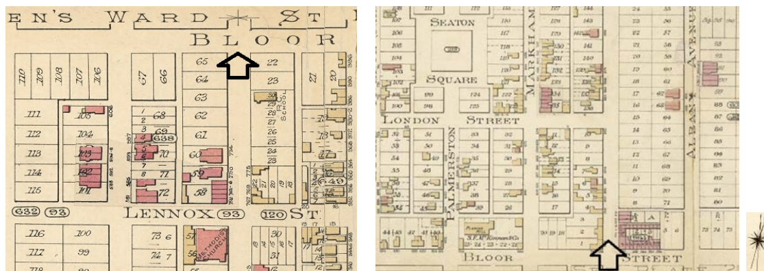
Goad's Atlas, 1894, south (left) and north (right) of Bathurst-Bloor

The former park lots southeast and southwest of the Bathurst-Bloor intersection were also subdivided during the late 19th century when the opening of residential neighbourhoods was traced on Goad's Atlases (fire insurance maps). The 1884 Atlas (above left) was the first to illustrate this part of the city where little development had occurred south of the intersection (although Bathurst Methodist Church was in place to serve new congregants), and to the northeast (above right) Seaton Village was soon to be annexed by the City of Toronto in 1888.