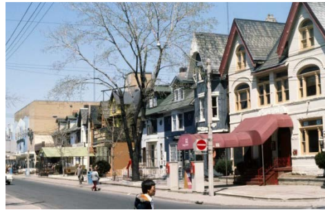
Mirvish Village, showing the east side in the 1960s (above left), both sides from Lennox Street in the 1970s (above right), the west side from Bloor Street West in 1982 (below left) and the east side near Bloor in 1982 (below right)

Beginning in the late 1950s, Mirvish assembled all of the house form buildings on the east side of Markham Street between Bloor and Lennox Streets with the intention of replacing them with a parking lot for "Honest Ed's" until the City refused the proposal.