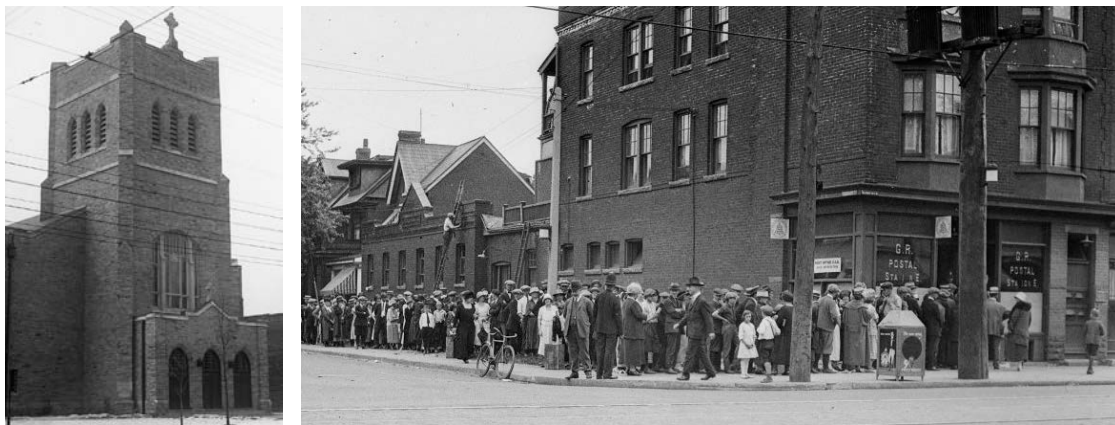
St. Peter's Roman Catholic Church (1924) on the west side of Bathurst Street, north of Bloor Street (above left), and the commercial building (above right) at 585 Bloor Street West anchoring the southwest corner of Markham Street in the Palmerston neighbourhood

By the World War I era in Bathurst-Bloor, most of the vacant lots remaining on the residential streets in Palmerston (southwest) and Harbord Village (southeast) had been infilled with new houses with classically-inspired designs that distinguished them from their late 19th-century neighbours. The (West) Annex neighbourhood northeast of the Bathurst-Bloor crossroads boasted more substantial residential buildings where the lack of laneways (and stables) reflected the introduction of public transit to the area. Commercial buildings lined both sides of Bloor Street West, as well as sections of Bathurst Street. On Bathurst south of Bloor (above left), the first St. Peter's Church was in place on the east side of the street.