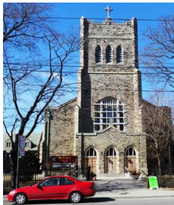
Fourplex at 588-594 Markham Street (above left); Wrigley Brothers' Grocery Store at 585 Bloor Street West (above right); St. Peter's Roman Catholic Church at 840 Bathurst Street (below)

Today, Bathurst-Bloor remains an important intersection in Toronto, which is adjoined by residential, commercial and institutional buildings that have cultural heritage value for their designs, historical associations and contextual importance.