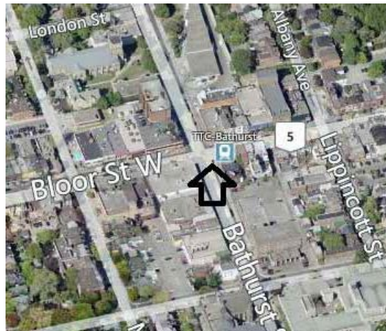
Aerial view of the Bathurst-Bloor intersection with the adjoining residential neighbourhoods the institutional buildings on Bathurst, the commercial buildings on Bathurst and Bloor, and Mirvish Village on Markham Street between Lennox and Bloor ( http://www.bing.com/maps ) The arrow marks the Bathurst-Bloor intersection.