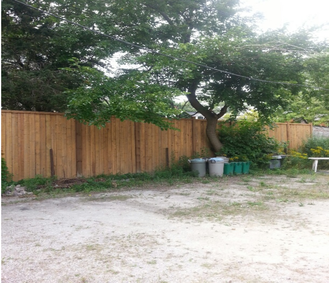
Photograph showing existing fence running along the south property line.