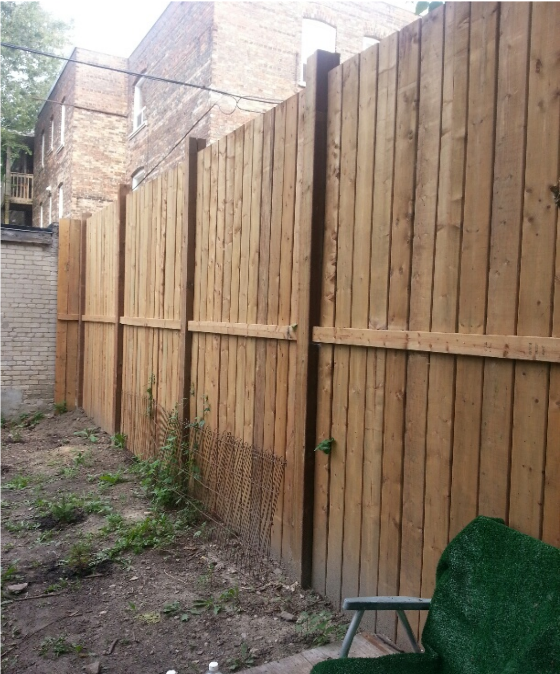
Photograph showing height and construction of existing fence.