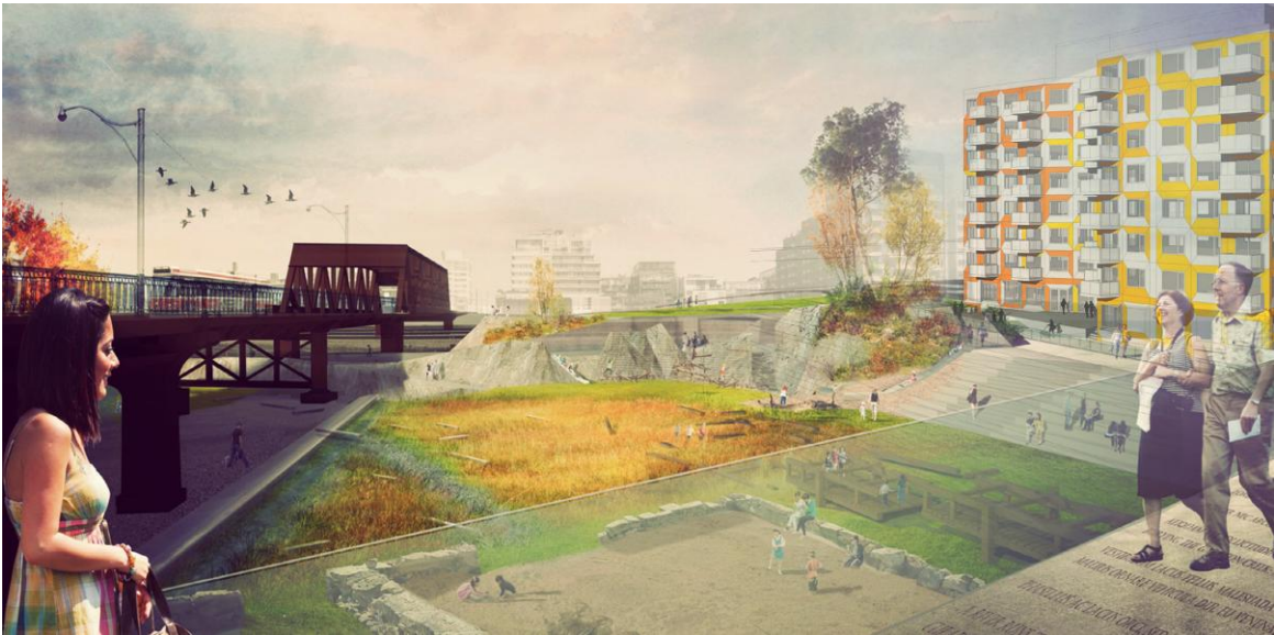
Results of the RFP to Develop and Operate Affordable Rental Housing at Queen's Wharf Road 20