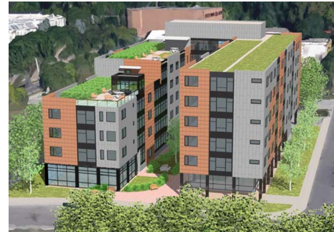
200 Madison Ave: 82 rental homes under a 50 year lease on a former Toronto Hydro site, using City and Fed/Prov. funding