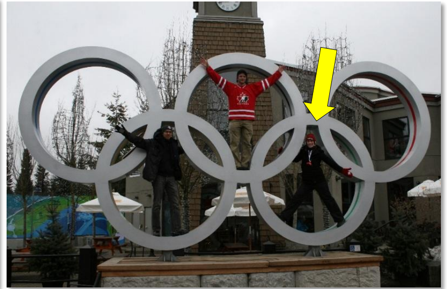
2010 - Vancouver Winter Games, Whistler