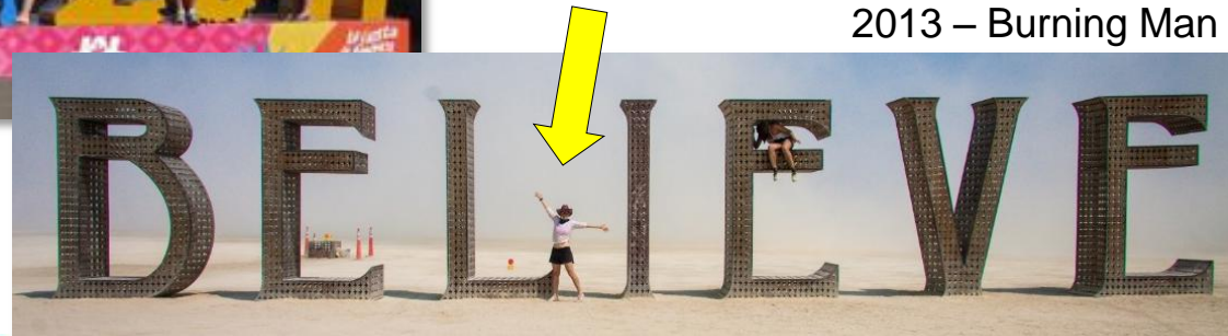
2013 - Burning Man