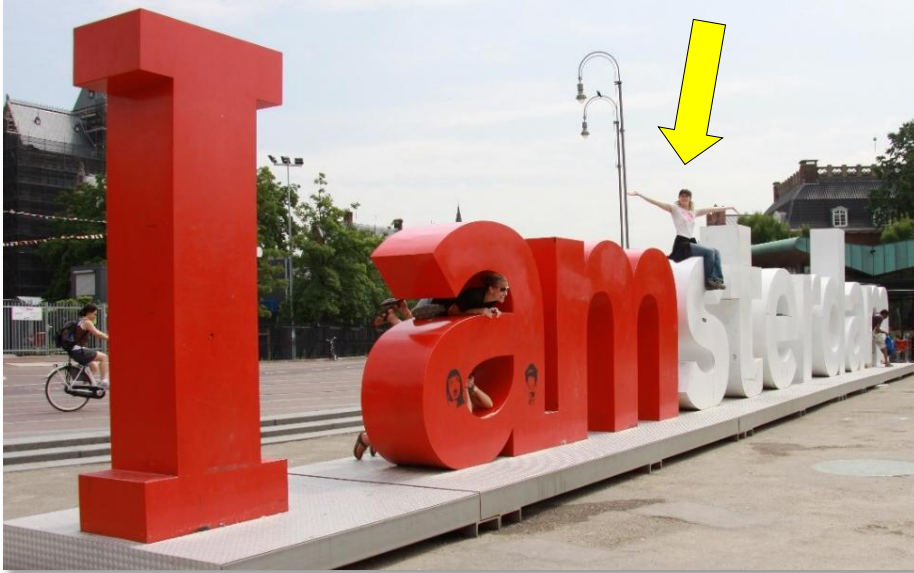
2010 - Amsterdam