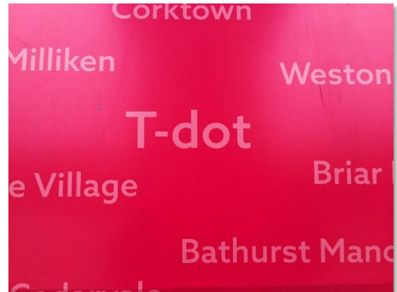
Example from current vinyl wrap