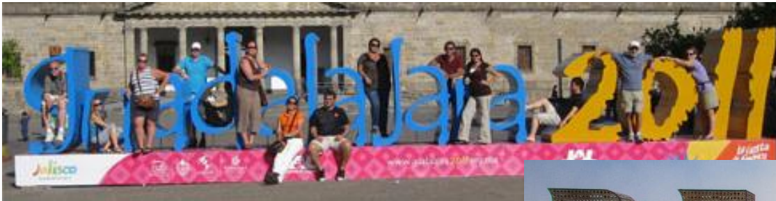
2011 - Pan Am Games - Guadalajara