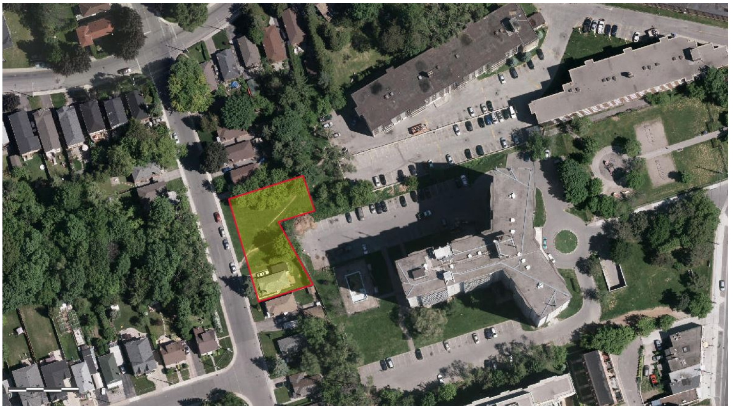
Staff Report for Action on Budget Adjustment to Fund the Acquisition of 47 Cedarcrest Boulevard