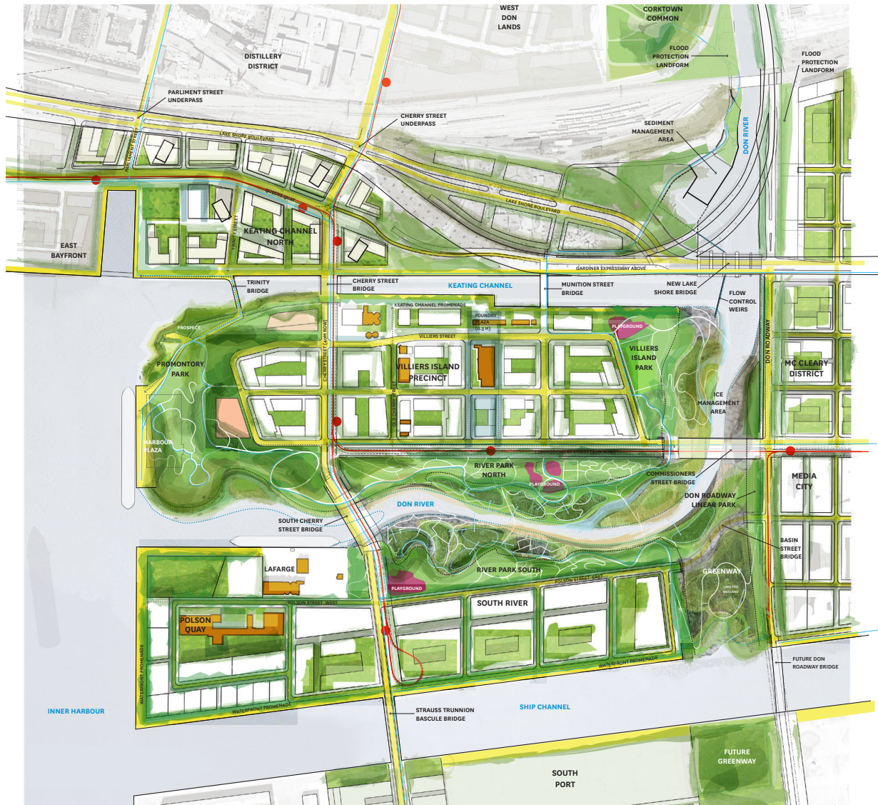
Figure 5 Aerial View of Proposed Full Vision for the Port Lands and Surrounding Areas