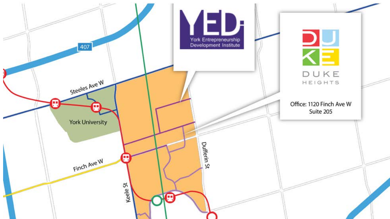
MAP OF DUKE HEIGHTS BIA: Showing boundary with York University.

are following closely, is to build partnerships with post-secondary institutions in order to develop entrepreneurial and educational opportunities. In order to develop this plan, we have begun a partnership with the Economics Department at York University, the York University Experience Hub, the York University Experiential Education Program, and have developed a partnership with YEDI, a business accelerator that is partnered with the Schulich School of Business and is found within the BIA boundaries. We have also met with a number of other stakeholders, such as Seneca College's President, York University's student union and others. The point is that we are doing a significant amount of work to develop employment and training programs that would bridge the academic institutions in Ward 8 with our over 2,500 businesses. The BIA would continue to benefit from being on the same ward as York University and Seneca College. There are countless benefits to this being the case and little consequence for this not being done.