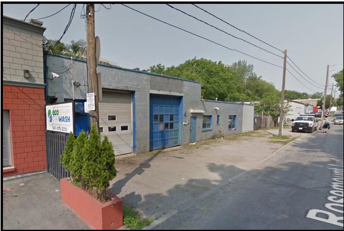
Staff report for action – Demolition approval 4 Rosemount Ave.