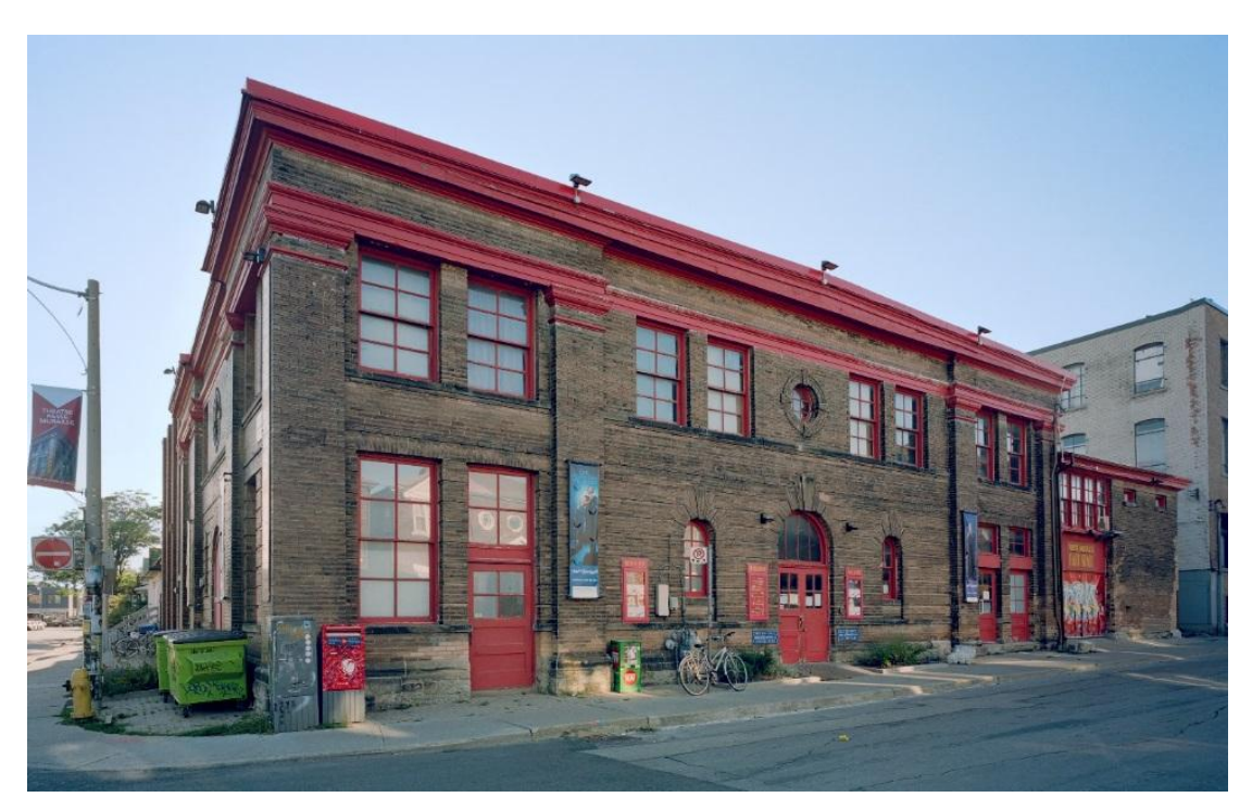
16 Ryerson Avenue Theatre Passe Muraille

Project: To restore two existing entrances on the principal elevation, including doors, door frames, and transom windows. In the central door opening, two replacement doors will be replicated based on photographs of the original doors.