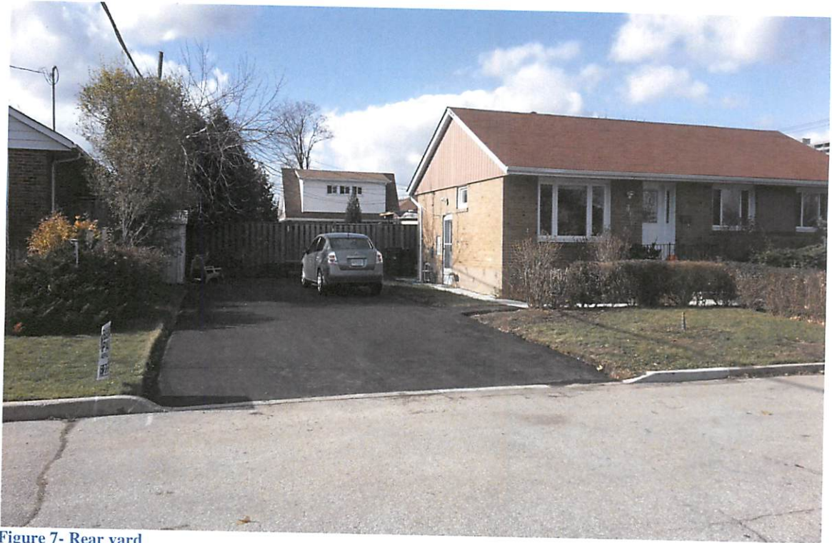
Figure 7- Rear yard