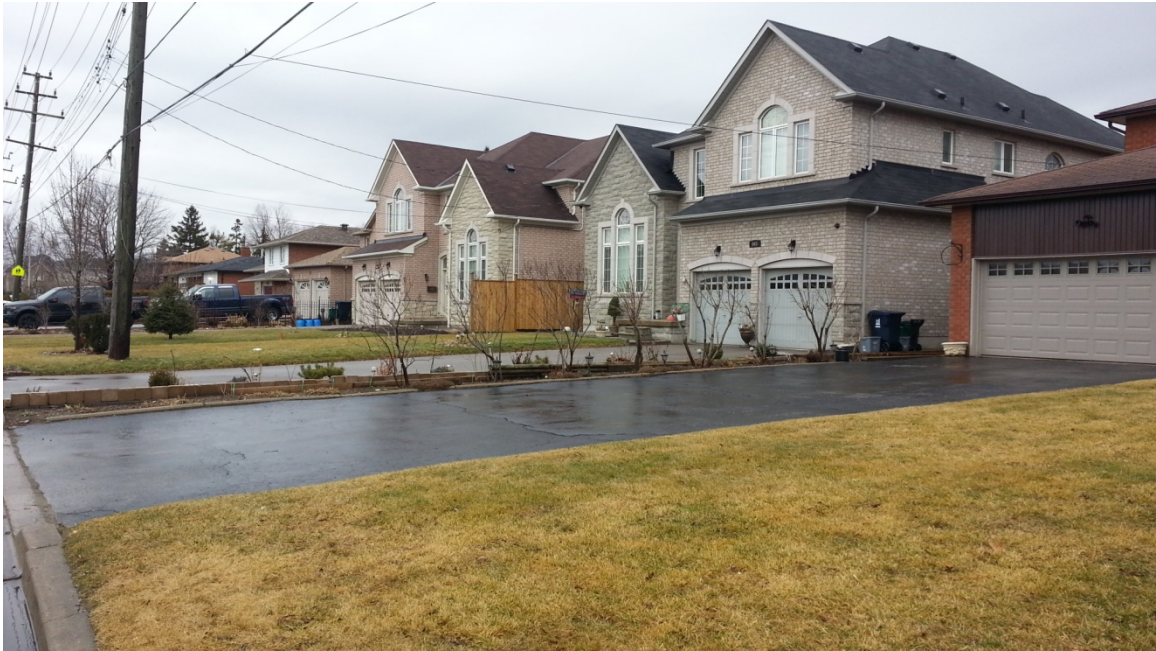
545 Morrish Rd-photo 3