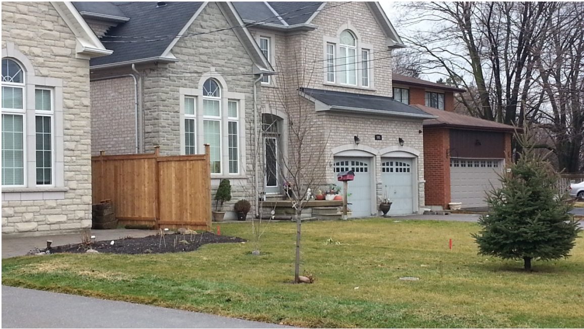
545 Morrish Rd-photo 7