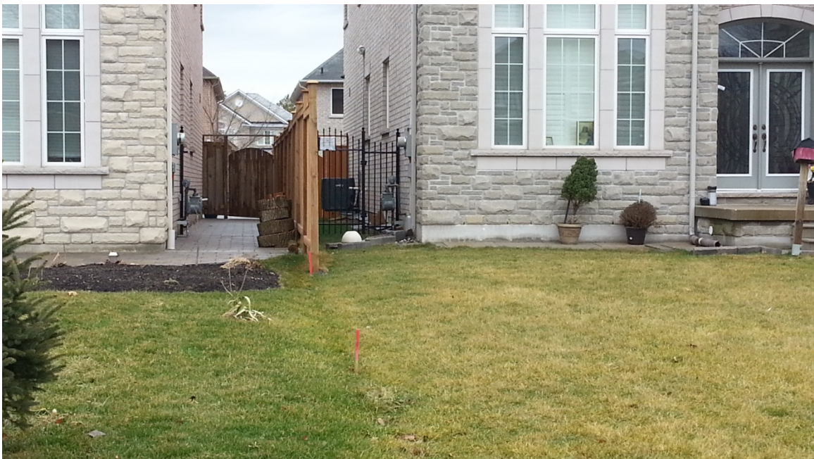
545 Morrish Rd-photo 6