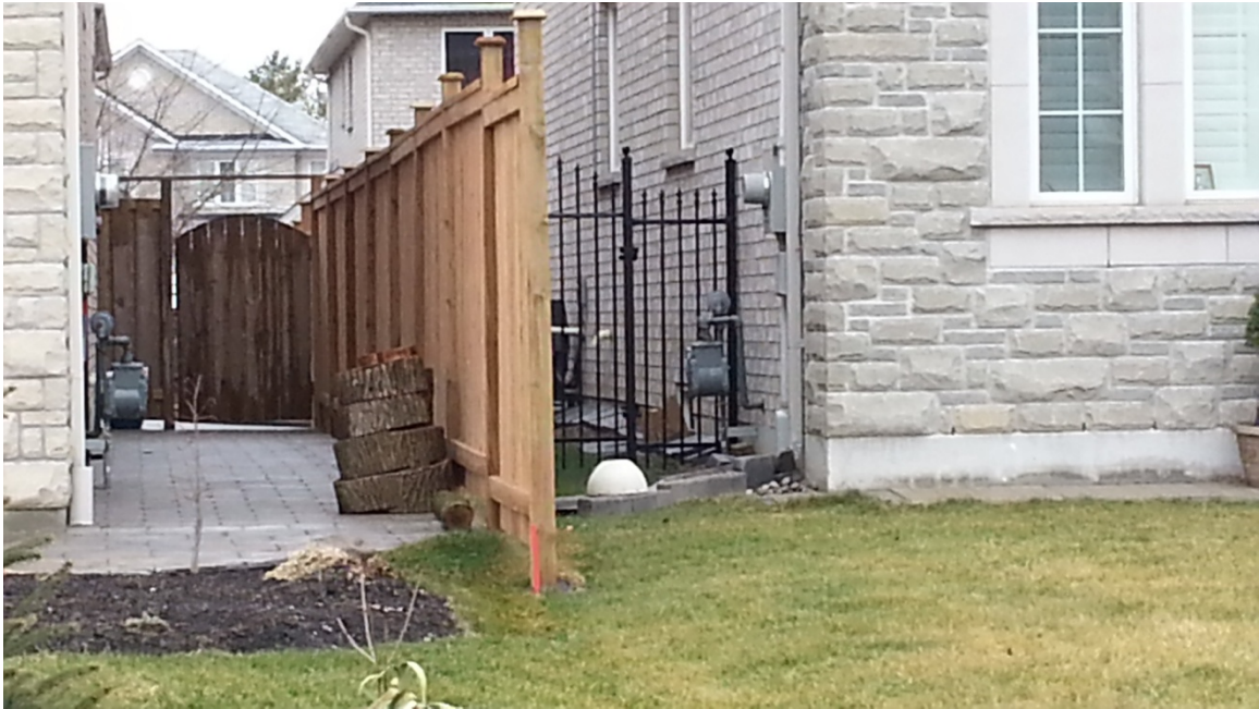
545 Morrish Rd-photo 5