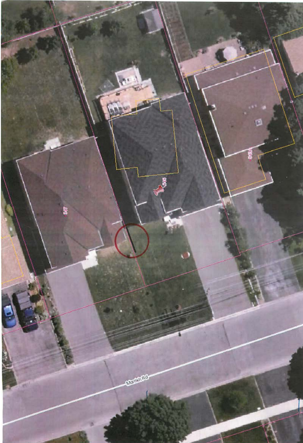
Appendix 2 - Proposed Fence Location Plan View