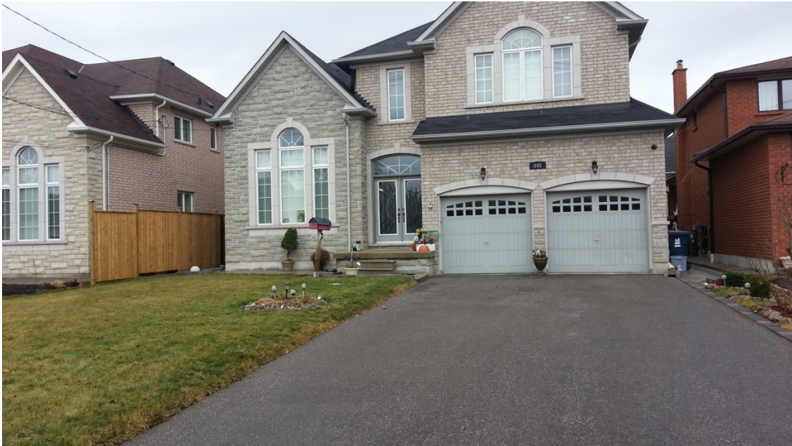
545 Morrish Rd- Photo 1