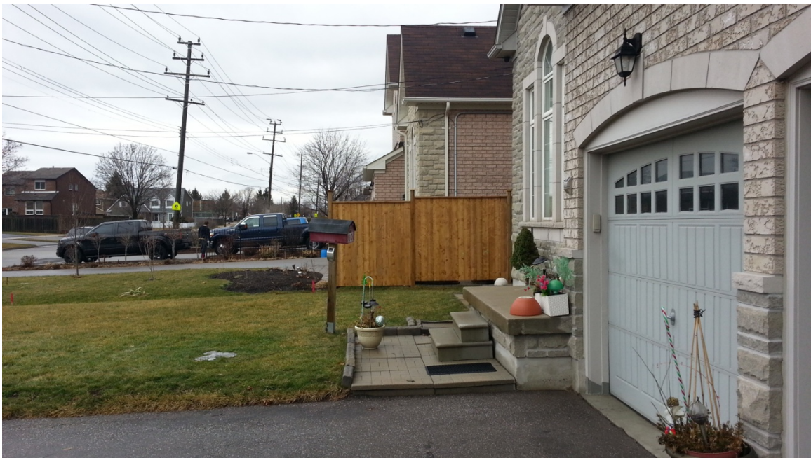
545 Morrish Rd- Photo 2