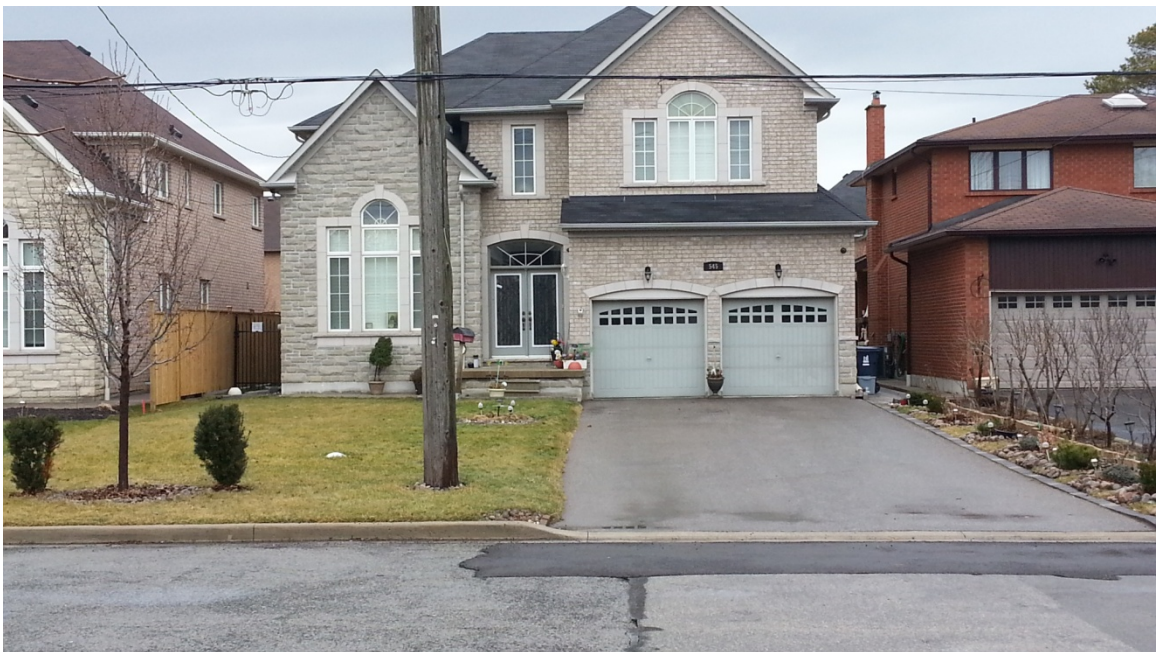
545 Morrish Rd-photo 4