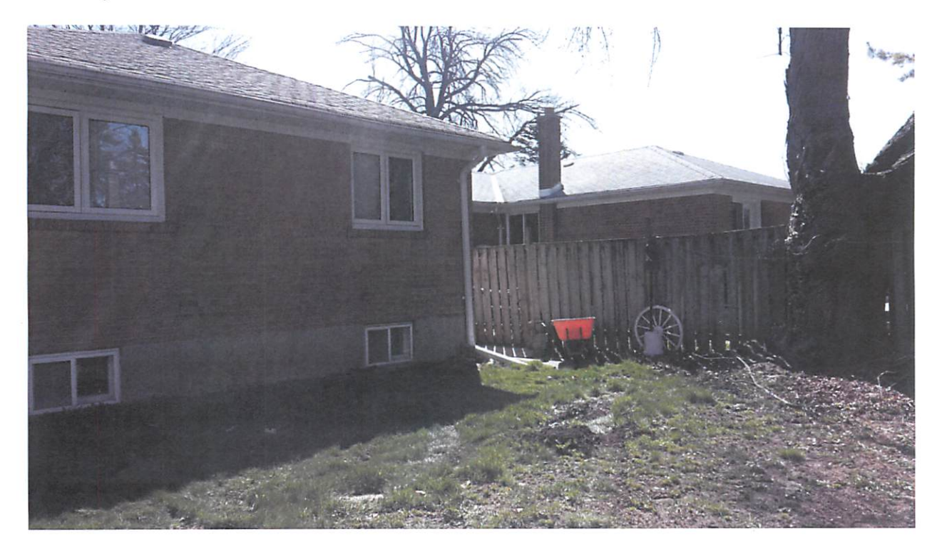
238 Livingston Road-Photo 1 Rear Yard