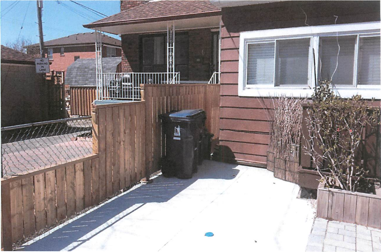
138 Byng Ave-photo 3