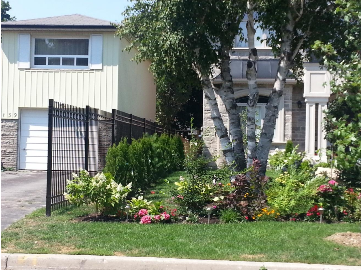
Photo of existing 1.65m high fence at 141 Earlton Road