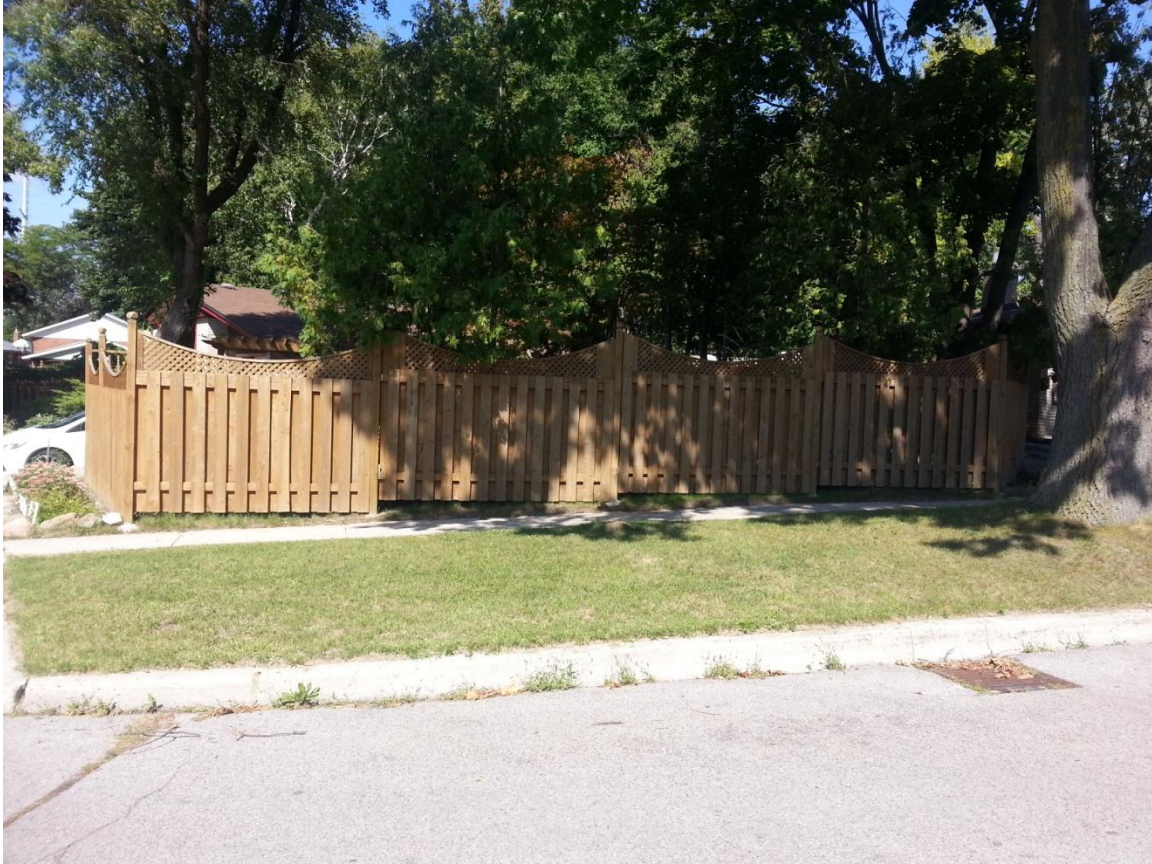
Photo of the front yard of 4 Benary Crescent facing west.