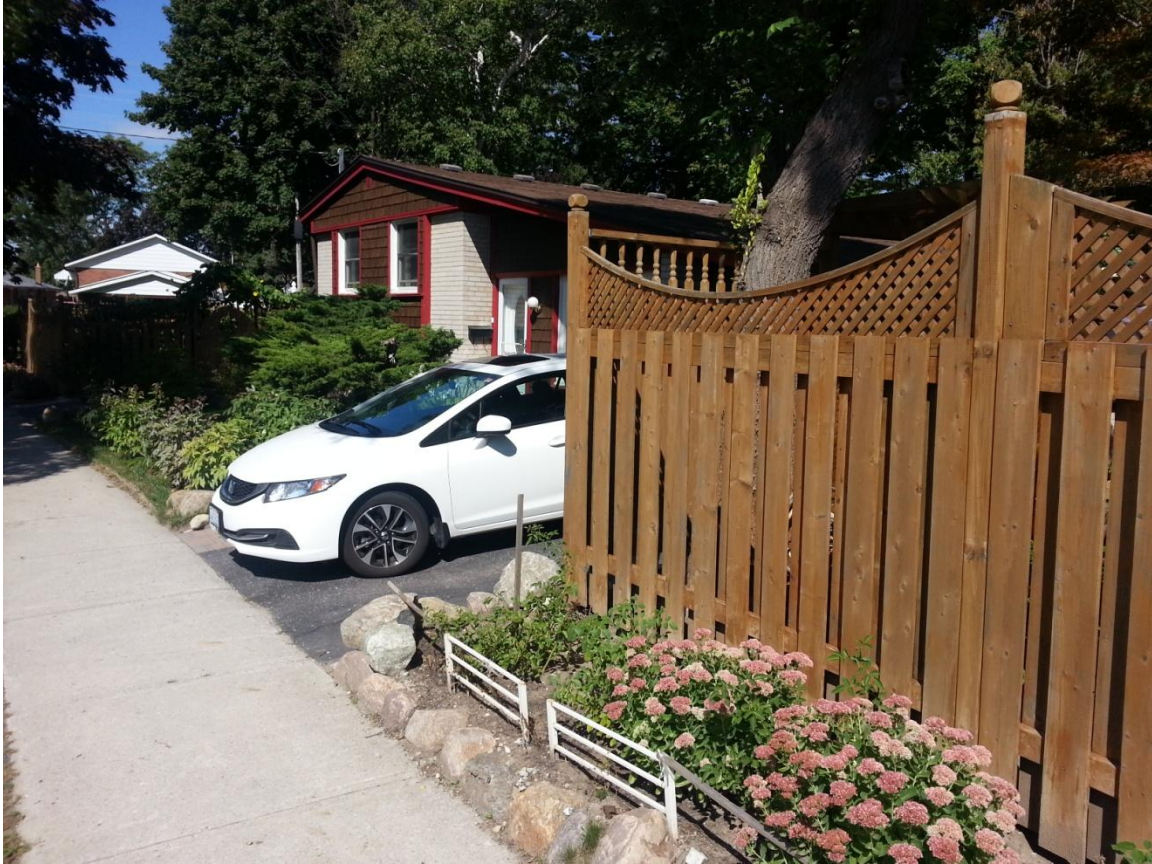
Photo of south/east corner of the east driveway flankage yard of 4 Benary Crescent