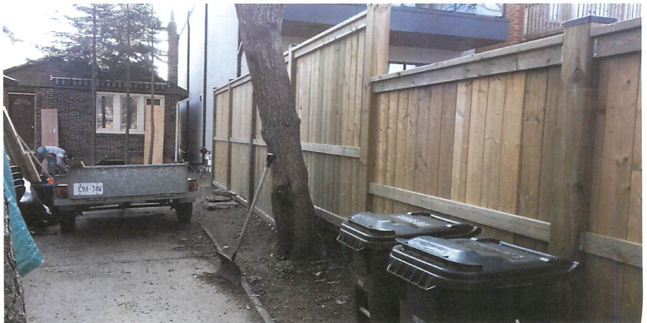
Photo 2 South side yard