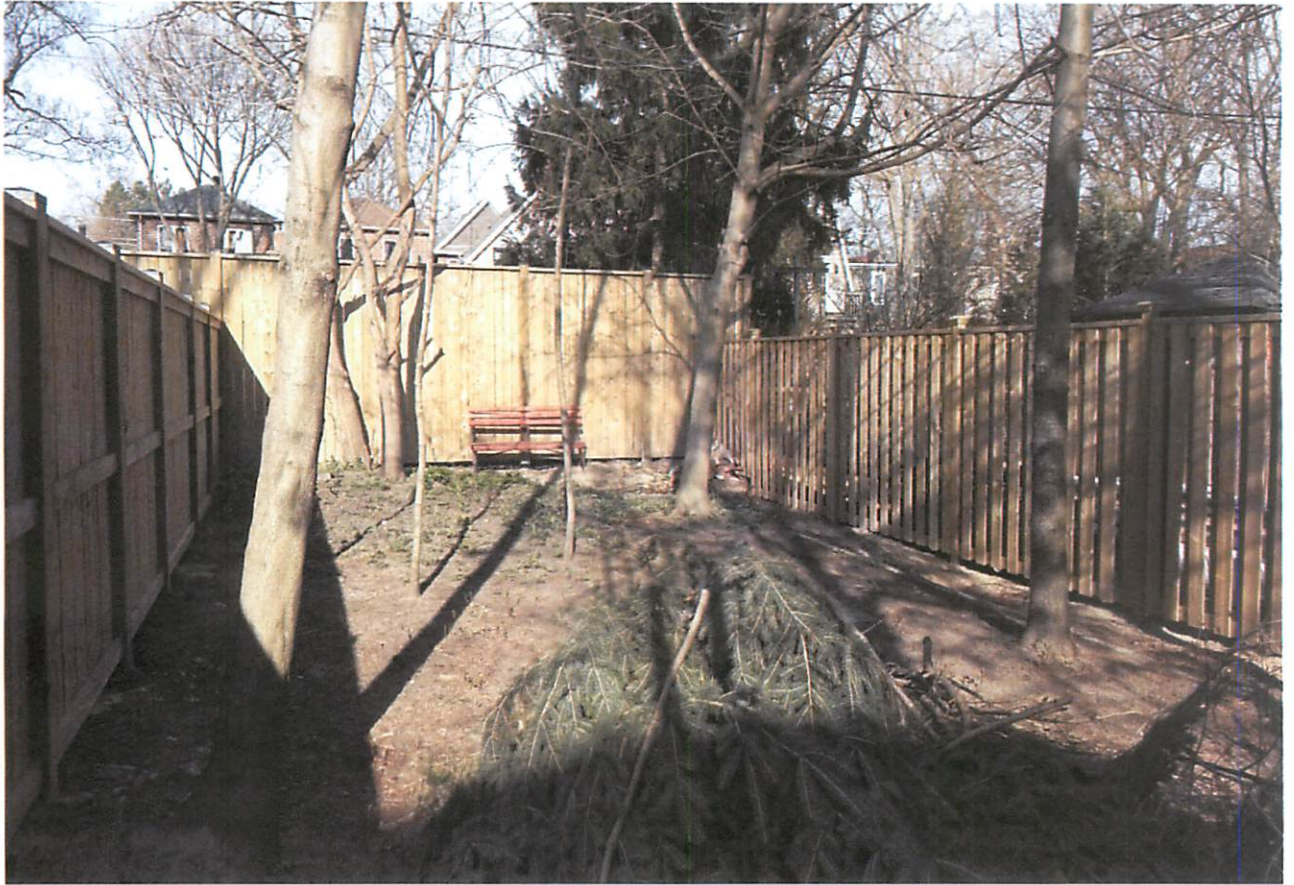
Photo 1 West side rear fence