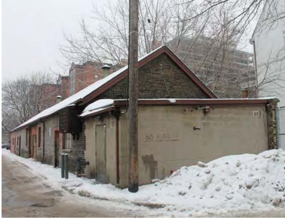
View of concrete addition (to be removed) looking east