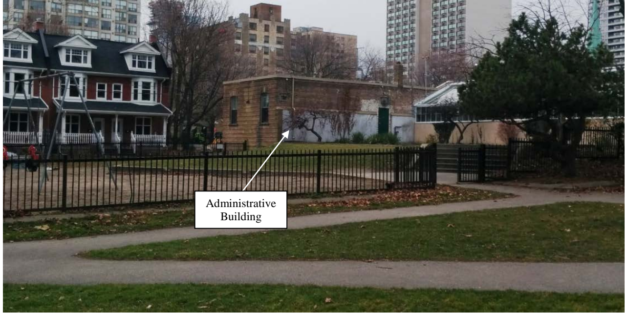
View looking southeast