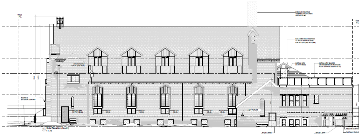
Proposed South (Side) Elevation – 175 Jones Avenue