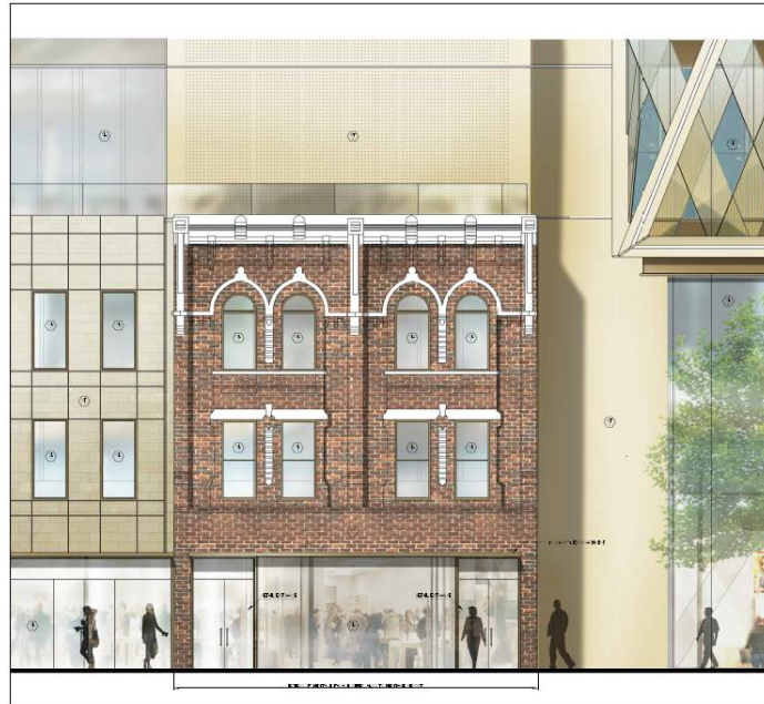
East Elevation at Heritage Facade